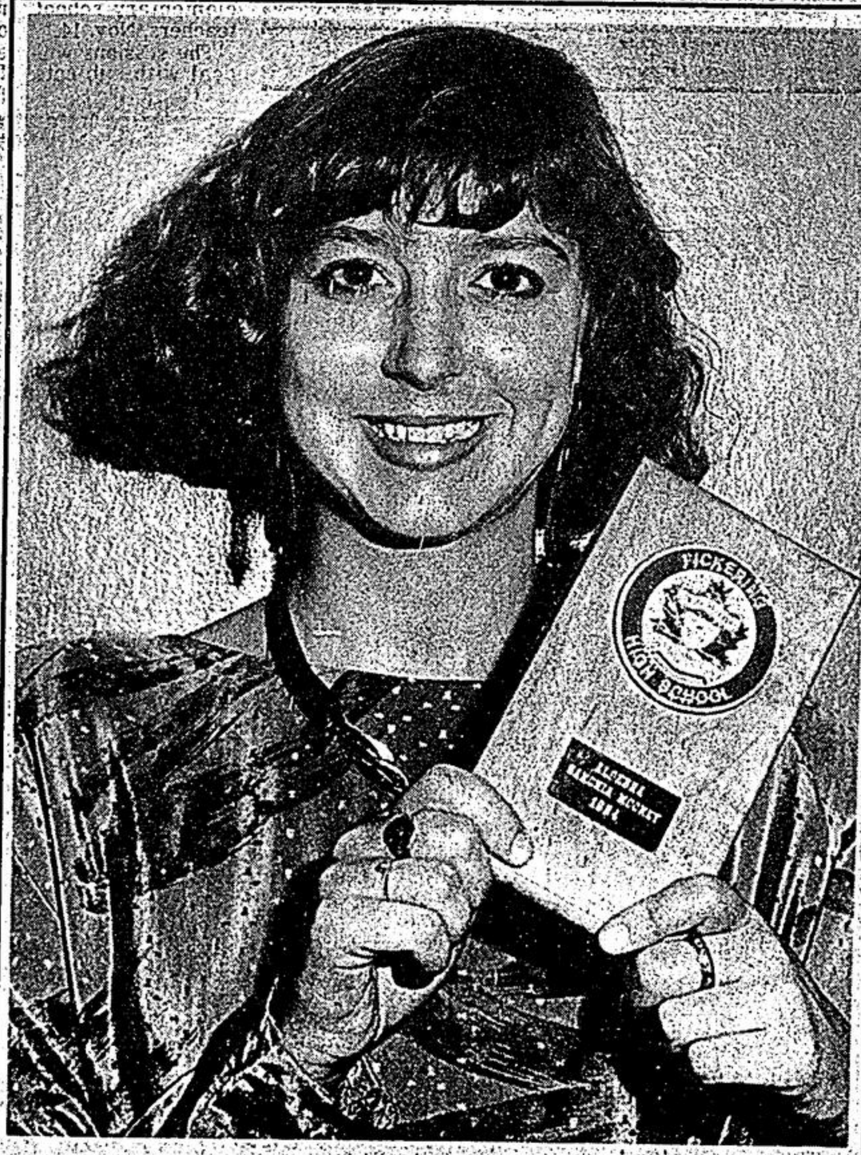
Claremont student honored

President Emeritus Wilfrid Laurier University SPEAKS ON THE CHRISTIAN HOME IN A SECULAR SOCIETY "The Cost of the Christian Home" Friday, Nov. 9 at 7:30 "Communication in the Home" Saturday, Nov. 10 at 7:30 "Making Our Home Relations Christian" Sunday, Nov. 11 at 11:00 "The Christian Home in a Secular Society" Sunday, Nov. 11 at 7:30 Join in these anniversary services of GORMLEY MISSIONARY CHURCH For more information call 887-9325