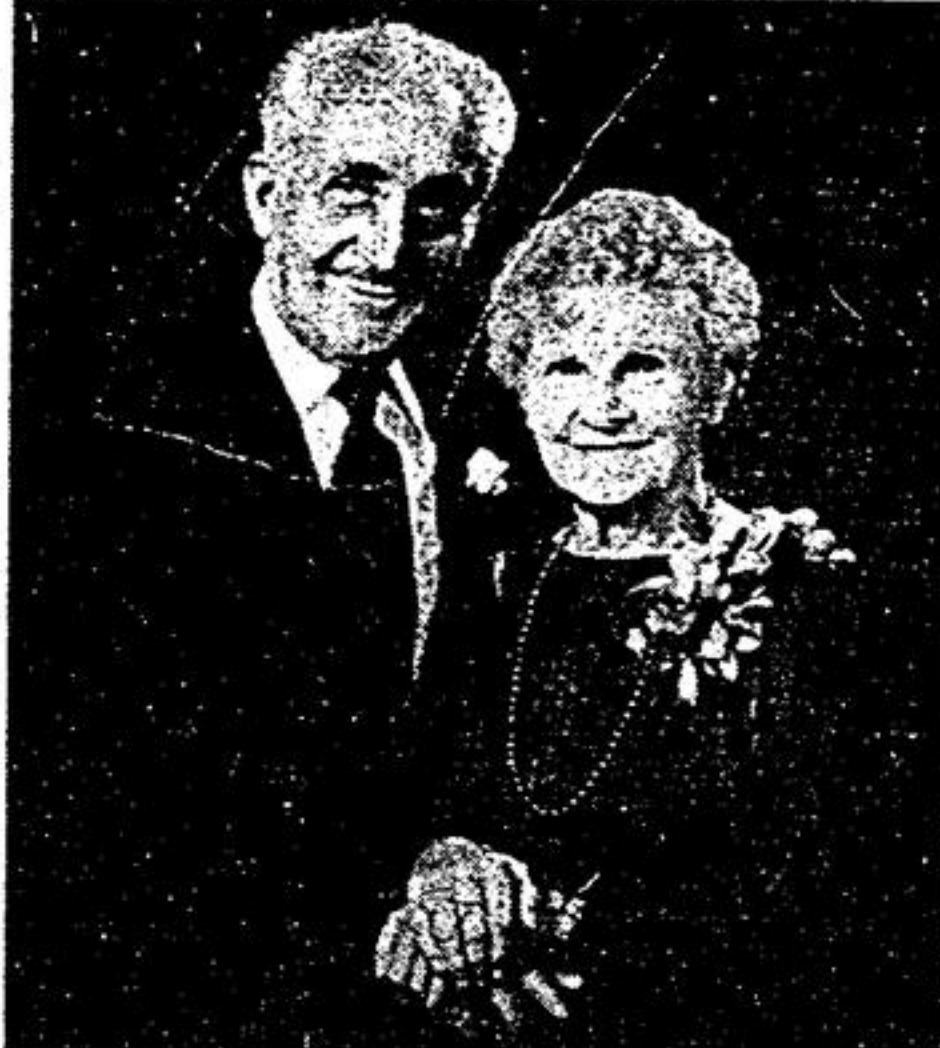
Only You Can Give This Christmas

TAKE ADVANTAGE OF OUR CHRISTMAS SPECIAL • Receive 2 Complimentary 8x10's with each 16x20 portrait purchased.