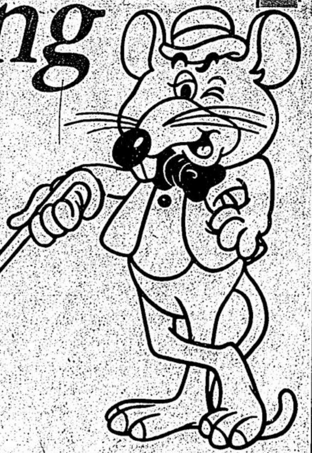
Chuck E. Cheese