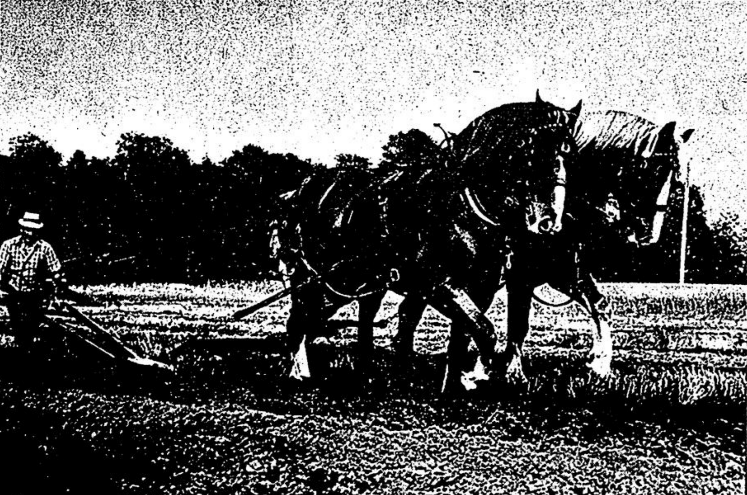
There were five entries in the Open Horse Class, Saturday, one of the largest in the yearly show.