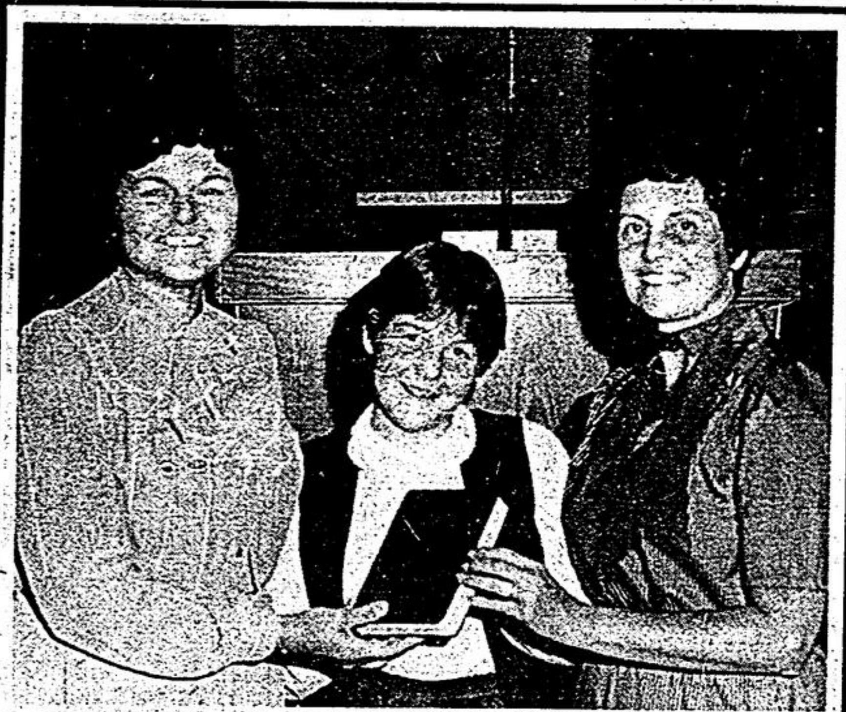
Pioneer Girl receives highest award