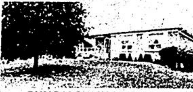
BUNGALOW IN MARKHAM RETIRING OR FIRST HOME?