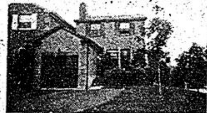
QUIET COURT NEAR CONSERVATION $118,900

Describes this 4 bedroom home with large sunny family living spaces. Very private yard, beautifully landscaped and - 12% mortgage. Rose Tomassini 294-1372.