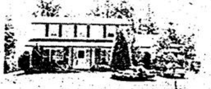
OPEN HOUSE SUN 2 - 4 PM

98 Senator Reesors Dr. Pool southern exposure. Mature trees.