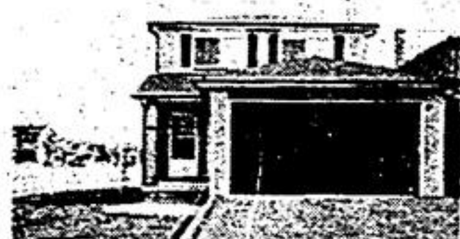
WITHIN YOUR MEANS

On 1 acre in exclusive area! Architect designed home! Unaltered craftsman construction. Original owner. A very special property. $299,900. Carolyn London 294-1372.