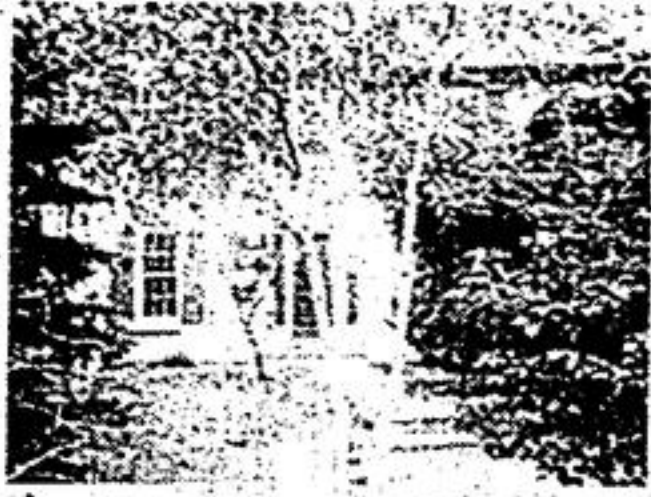
TOTAL PRIVACY RAVINE $179,900

This quality home offers all the comforts. Walk along the Rouge Rive or cross country ski in winter. Gabriele Poschar 29-1372