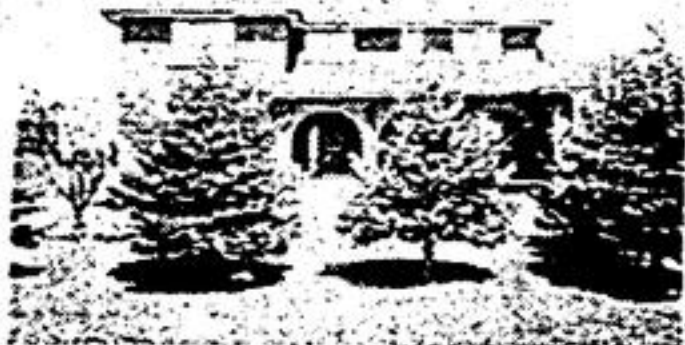
CUSTOM BUILT DELIGHT