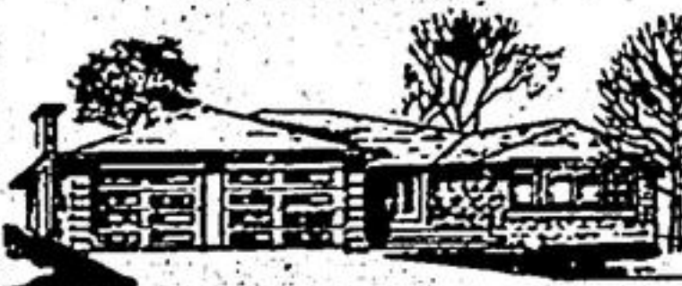
$108,900 BUNGALOW! 1600 SQ. FT.