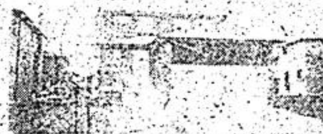
HE WHO HESITATES

THINKING ABOUT BUYING? Get the facts first. Ask us for a computer print-out about all the listings in town.