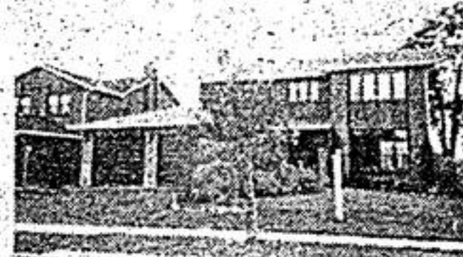
AVAILABLE IMMEDIATELY - EXQUISITE CRESCENT!

11% mortgage finances this newly decorated 8 room 4 bedroom backsplit on 61 ft. frontage. Lot top of line new broadloom. Many extras. A must to see. $114,900. Don Leyland 477-1270.