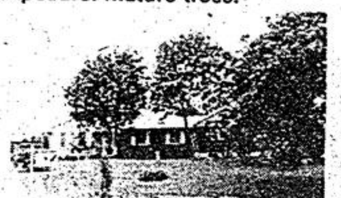
GIVE ME LAND LOTS A LAND!

will appreciate this value-packed home...over 2400 sq. ft., all drapes & upgraded, light fixtures remain, central air & vacuum systems, professionally landscaped, 11% financing! Karen Winlove-Smith 294-1372.