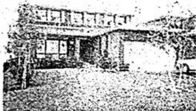
EVERYTHING AND MORE

98 Senator Reesors Dr. Pool southern exposure. Mature trees.