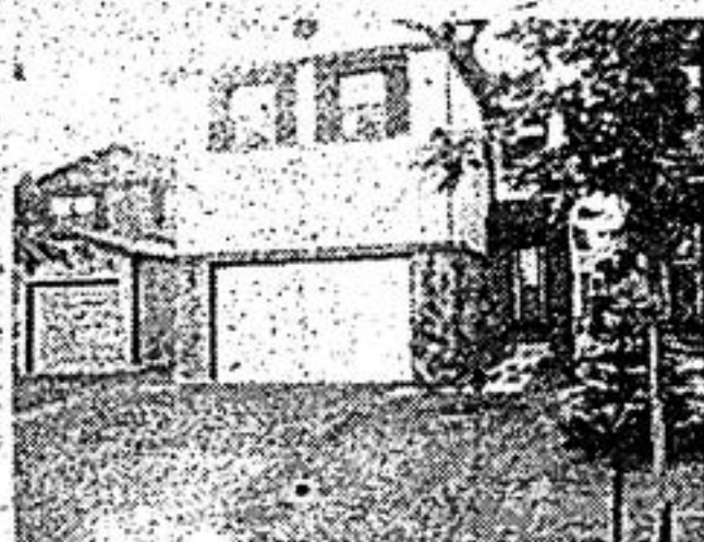
GORGEOUS BACKSPLIT LARGE LOT

More room in this Unionville home set in a pleasing complex than in many low-priced detached homes. $75,900. Mavis Smylie 477-1270, 477-2497