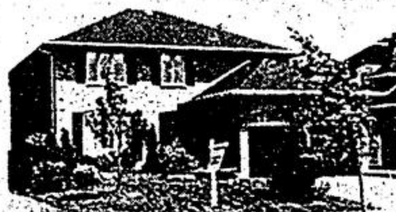
SHOWS TO PERFECTION UNIONVILLE