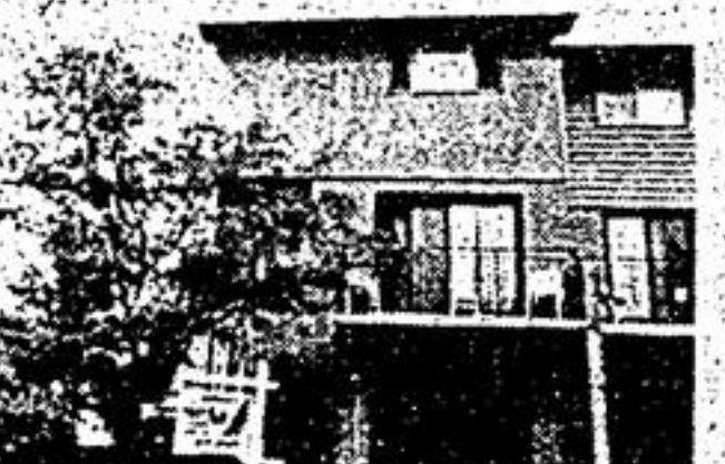
A GOOD START

Like new - starter home near shopping, park and public transit. Good financing, many extras. Just $89,900. Call Charlie Barnett 477-1270, 294-1180.