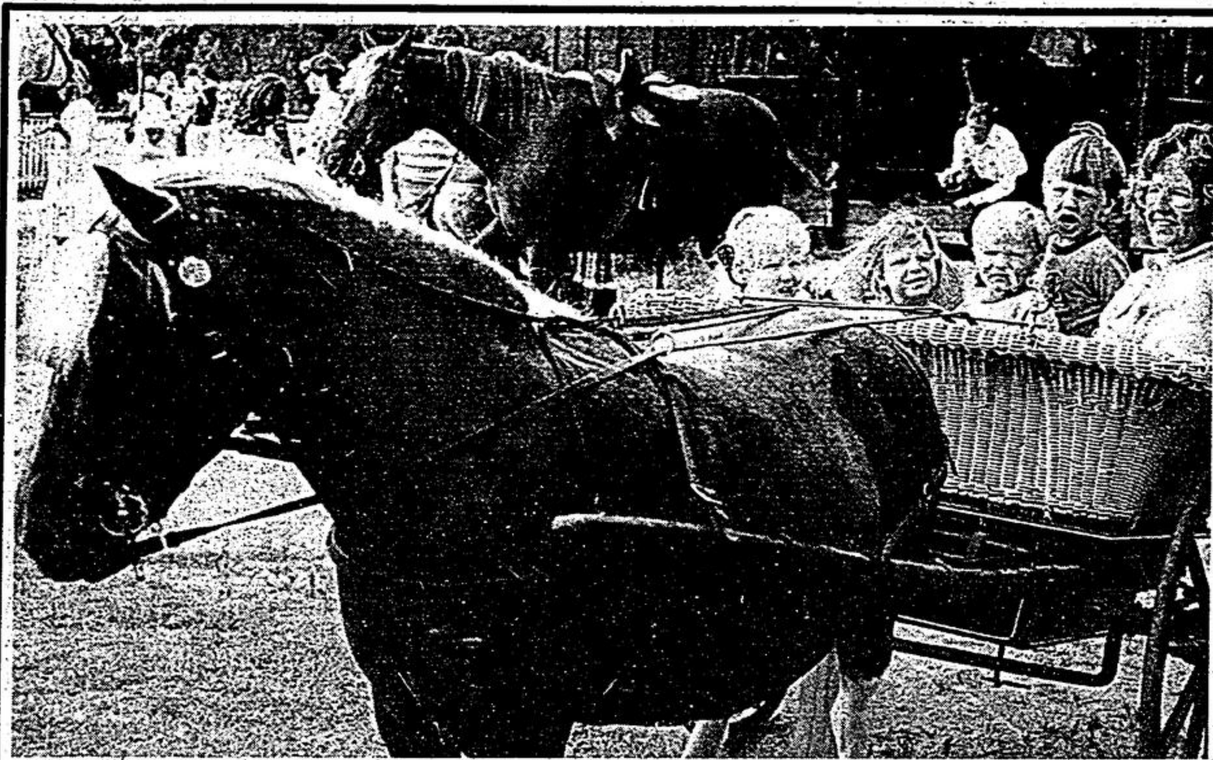
Four-legged transportation revived

Cause of the blaze hasn't been determined although an investigation is underway.