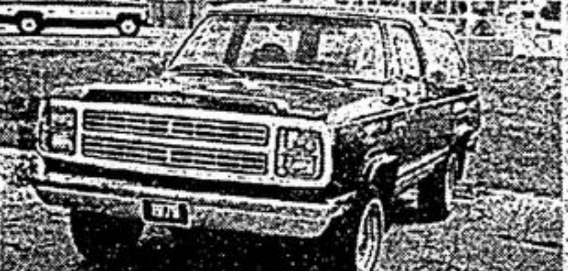
'79 DODGE RAM CHARGER 4x4 auto, P.S., P.B., radio, 2-tone red/black, cloth interior. Stock #UC88. ONLY $5,995*