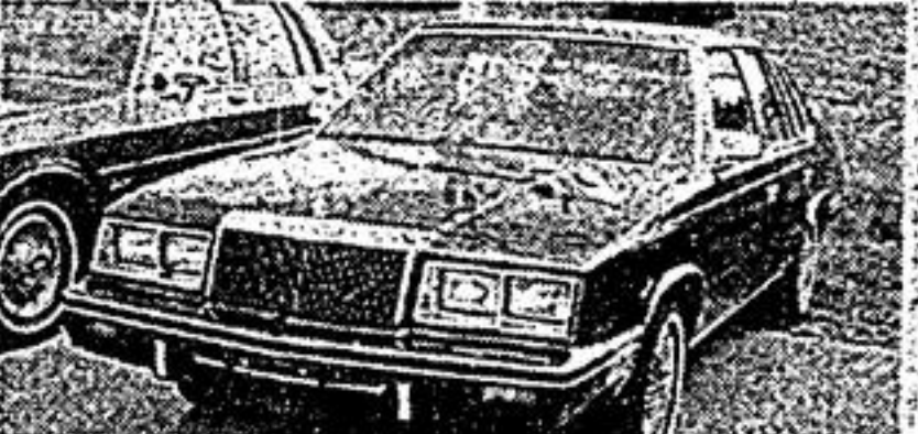
'84 CHRYSLER E-CLASS 4 DR. SEDAN Finished in black with matching burgundy cloth interior with full complement of factory options. Only 11,000 km. Stock #UC153.