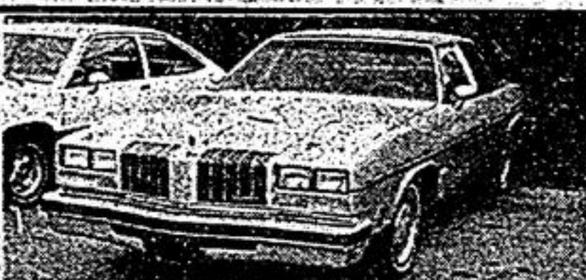
'77 OLDS CUTLASS BROUGHAM 4 DR. SEDAN Auto, P.S., P.B., P. windows, air/con., tilt steering wheel, vinyl roof. Stock #UC152.