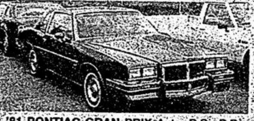
'81 PONTIAC GRAN PRIX Auto, P.S., P.B., buckets, console, tempmatic, air, con., AM/FM stereo, elect def., w. walls, w. discs. Stock #UC121A.