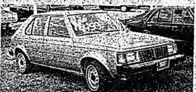
'81 DODGE OMNI 4 DR. SEDAN Finished in silver with upgraded cloth int., 4 spd., rear def., w. walls, radio. Stock #UC103.