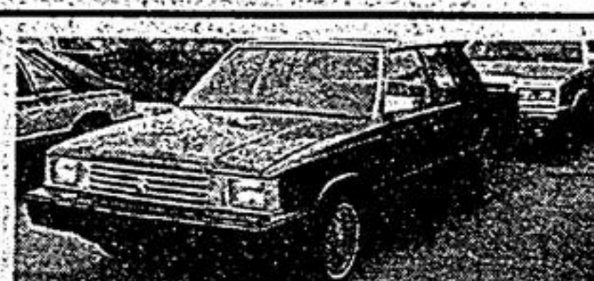
'84 DODGE ARIES 4 DR. SEDAN Auto, P.S., P.B., radio rear def., w. walls, w. discs, economical, family size car. Stock #UC133.