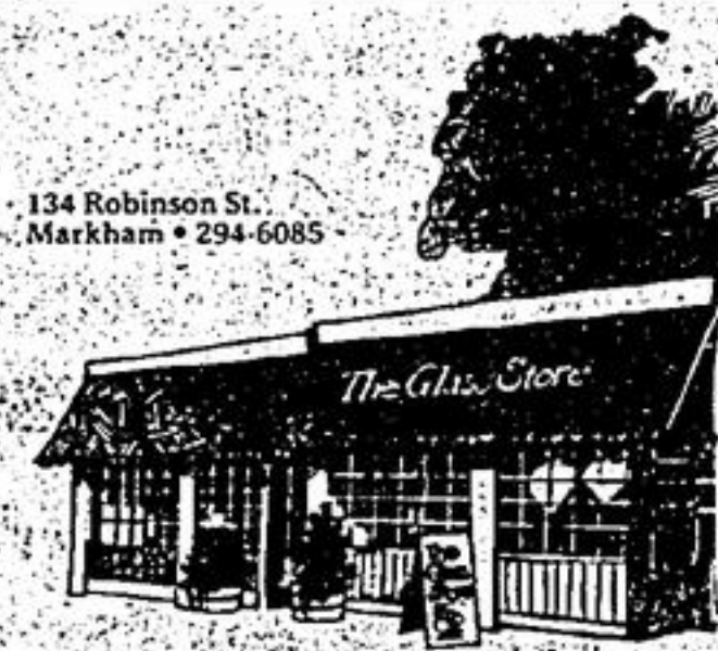
134 Robinson St., Markham • 294-6085