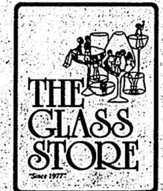
134 Robinson St., Markham • 294-6085

Mostly from Europe, our wide selection of handmade pilseners and beer mugs and steins can make any beverage taste better. Sparkling clear, in a variety of shapes and sizes; from round and compact to tall and slim. Prices start at $8.99.