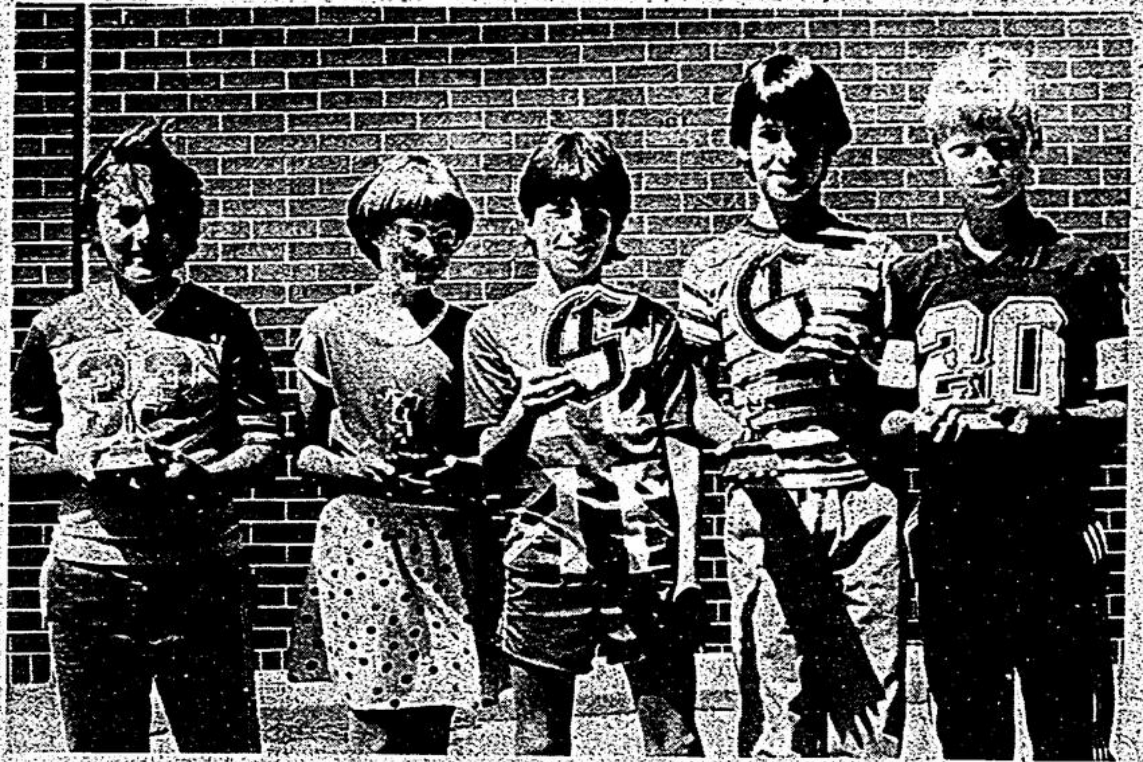
Trophies presented at Goodwood P.S.