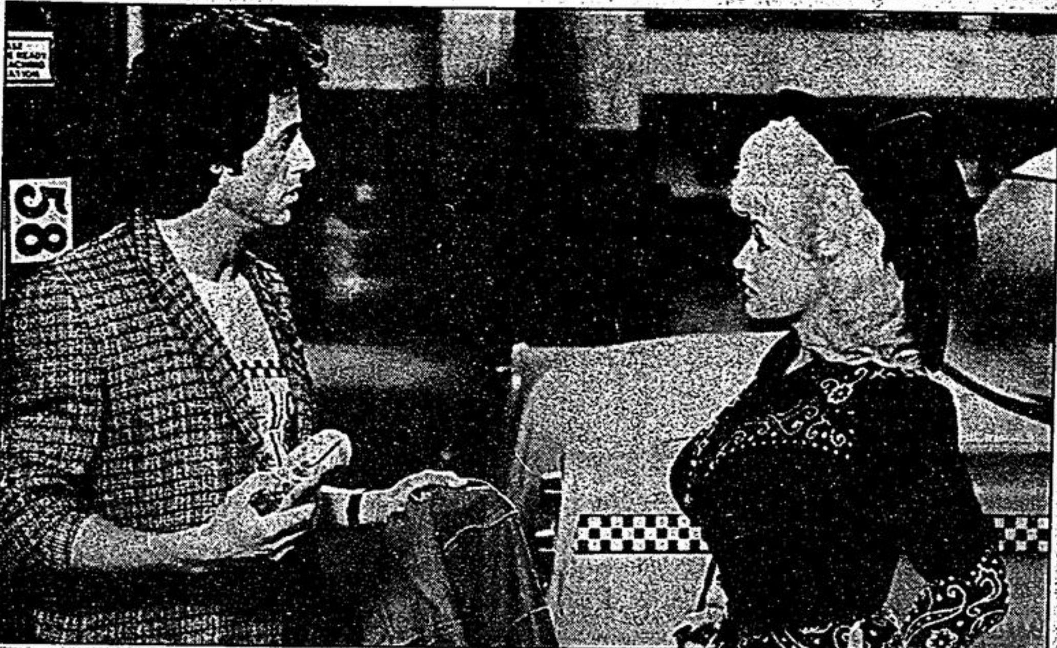
Nick Martenelli (Sylvester Stallone) is a New York City cab driver and Jake Ferris (Dolly Parton) has just two weeks to turn him into a country singer in Rhinestone, currently playing at the Markville Cinemas.

Rhinestone is now playing at Markville Cinemas