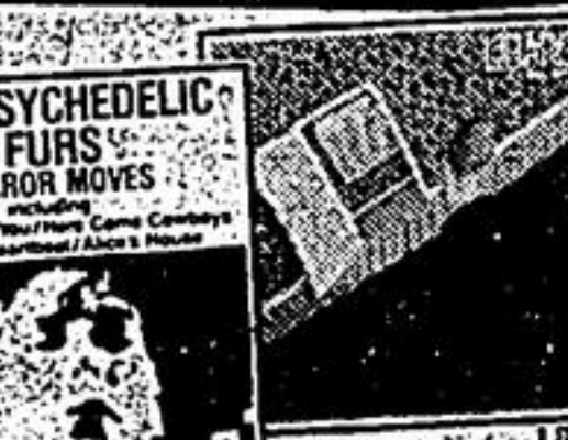
THE PSYCHEDELIC FURS "Mirror Moves"