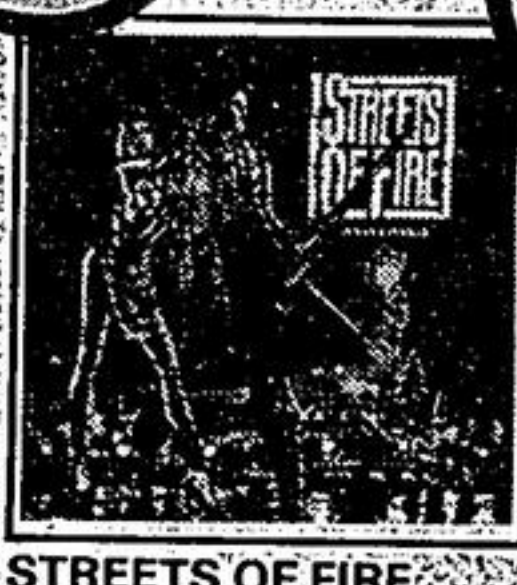
STREETS OF FIRE "Soundtrack"