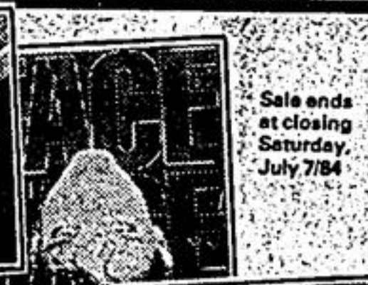
LABARGE "Barging In"