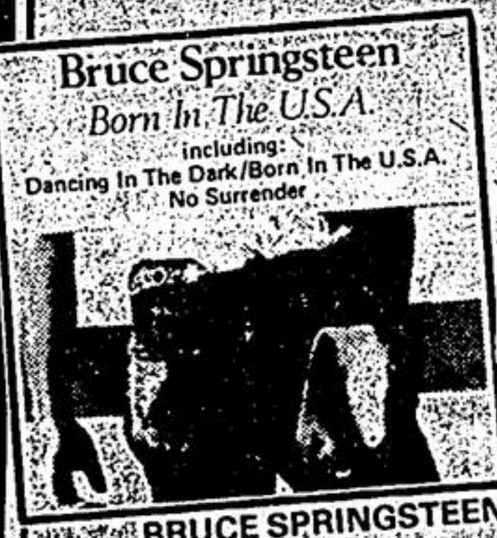
Bruce Springsteen "Born in the U.S.A." including: Dancing in the Dark/Born in the U.S.A. No Surrender