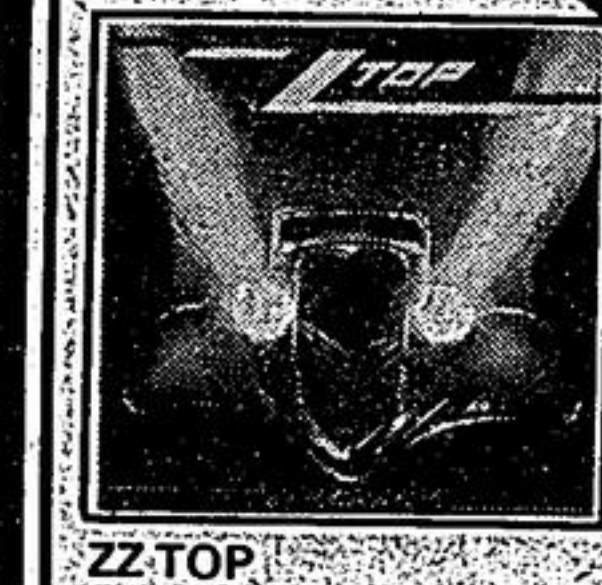
ZZ TOP "Eliminator"