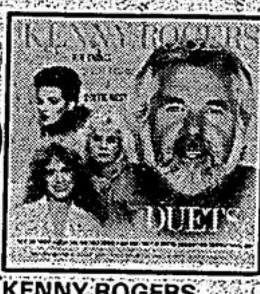
KENNY ROGERS "Duets"