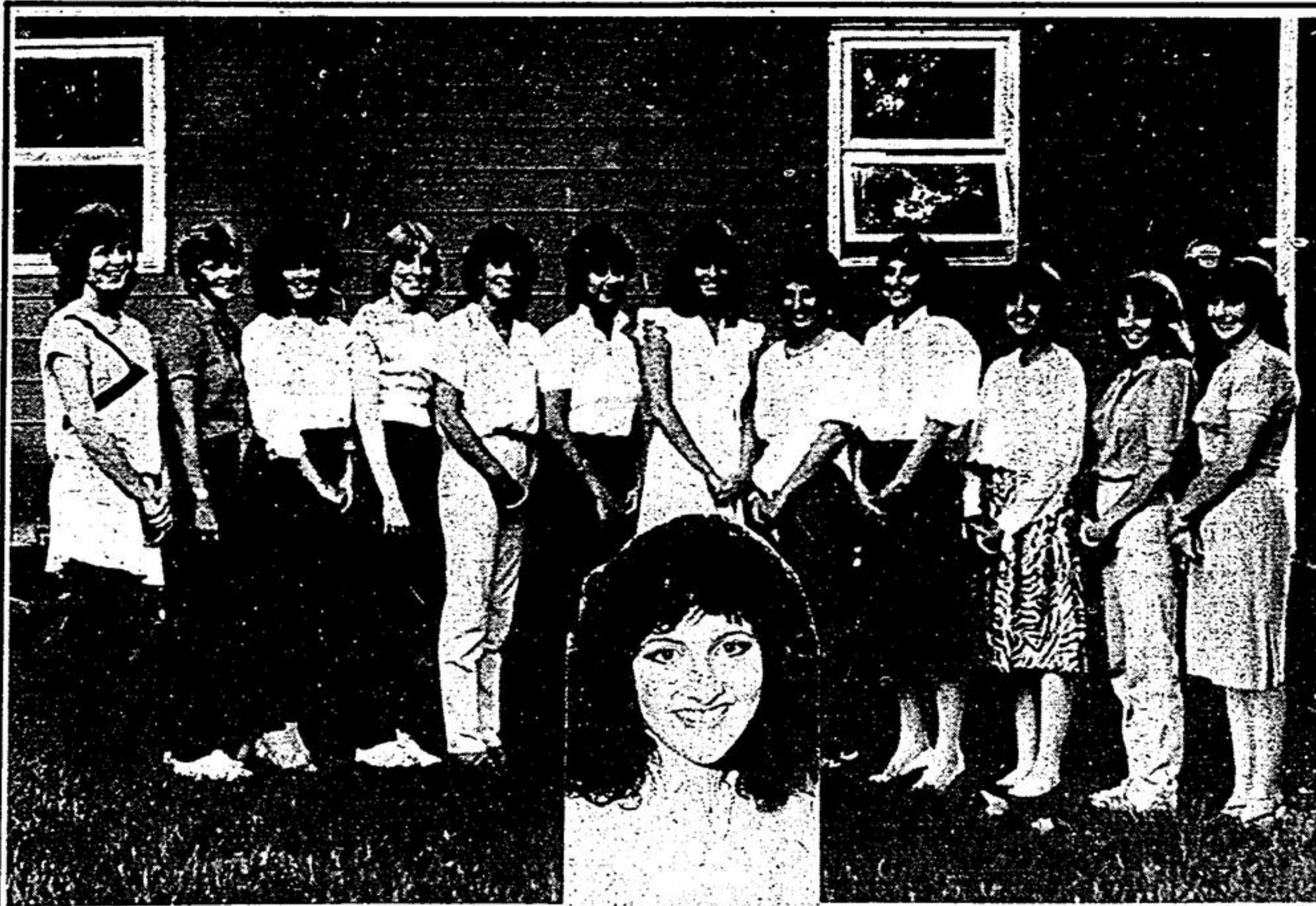
Thirteen lovely ladies to participate in Pageant, June 28

The sale date is Sat., June 23, beginning at 10 a.m. There are ten rooms filled with antique furniture including an oak dining room extension table and six oak chairs; an oak drop-front secretary with leaded glass doors; two 3-piece antique bedroom suites all in original finish; a walnut oval parlor table; a round wicker table; two pine blanket boxes in original finish; a 5-piece bedroom suite—the list is endless. Due to the magnitude of the sale, three auctioneers will take charge—Norm and Phil Faulkner and Earl Gauslin.