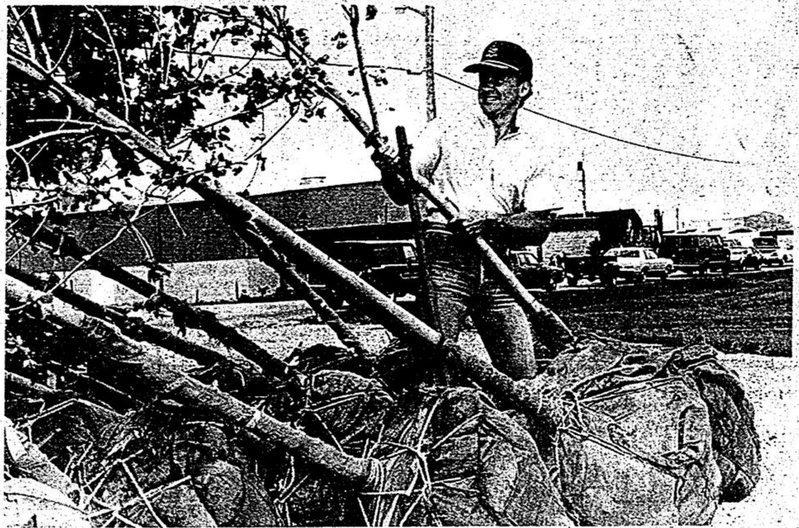
Tree-planting time at Markham Fairgrounds