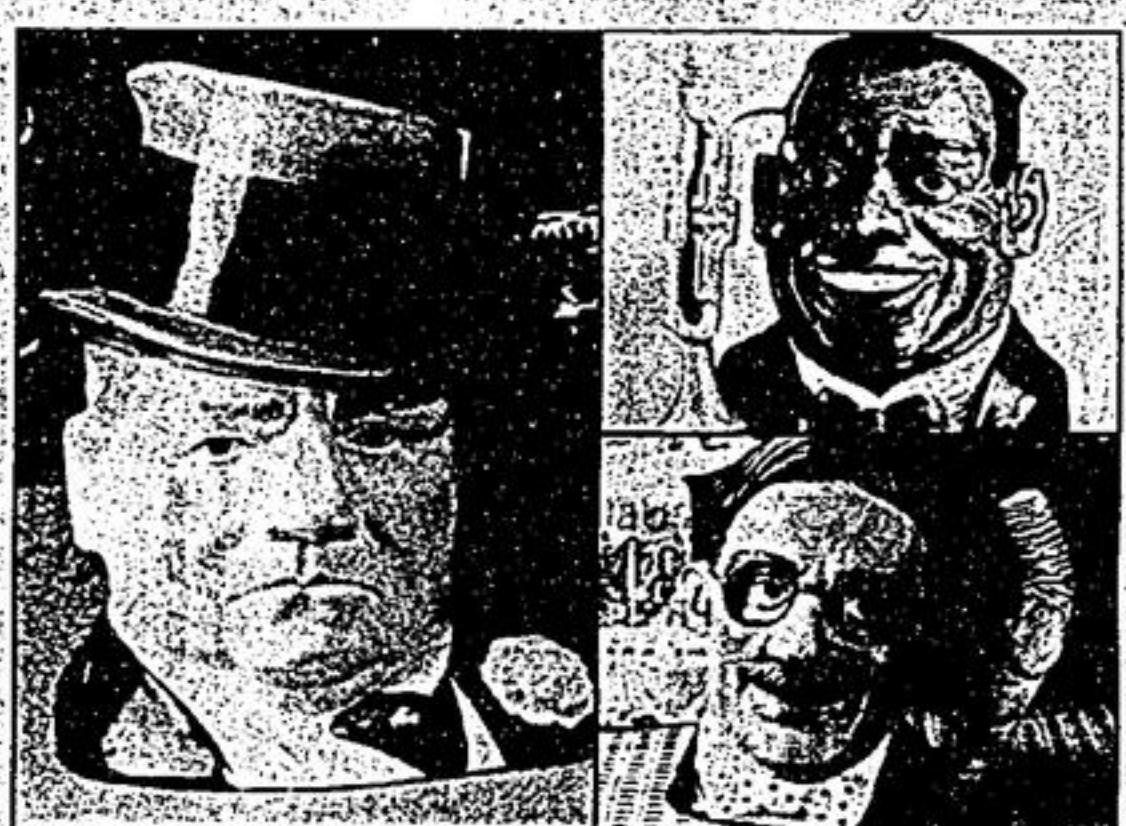
Celebrity Jugs by Royal Doulton are a charming change of pace from the usual Father's Day gifts. Colourful conversation pieces to accent his office or study. Come in and see this delightful collection. You might even launch a new hobby.