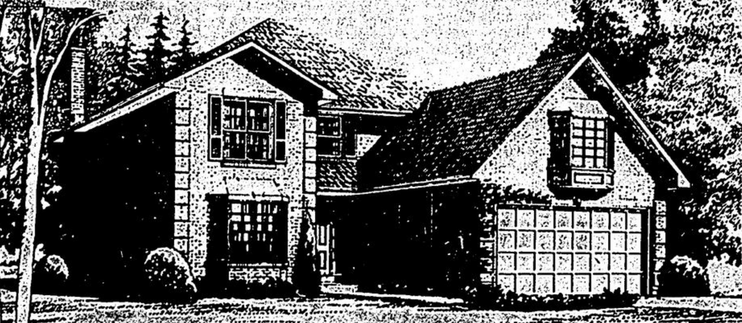
Illustrated: the Amber X $175,900 Artist's Concept