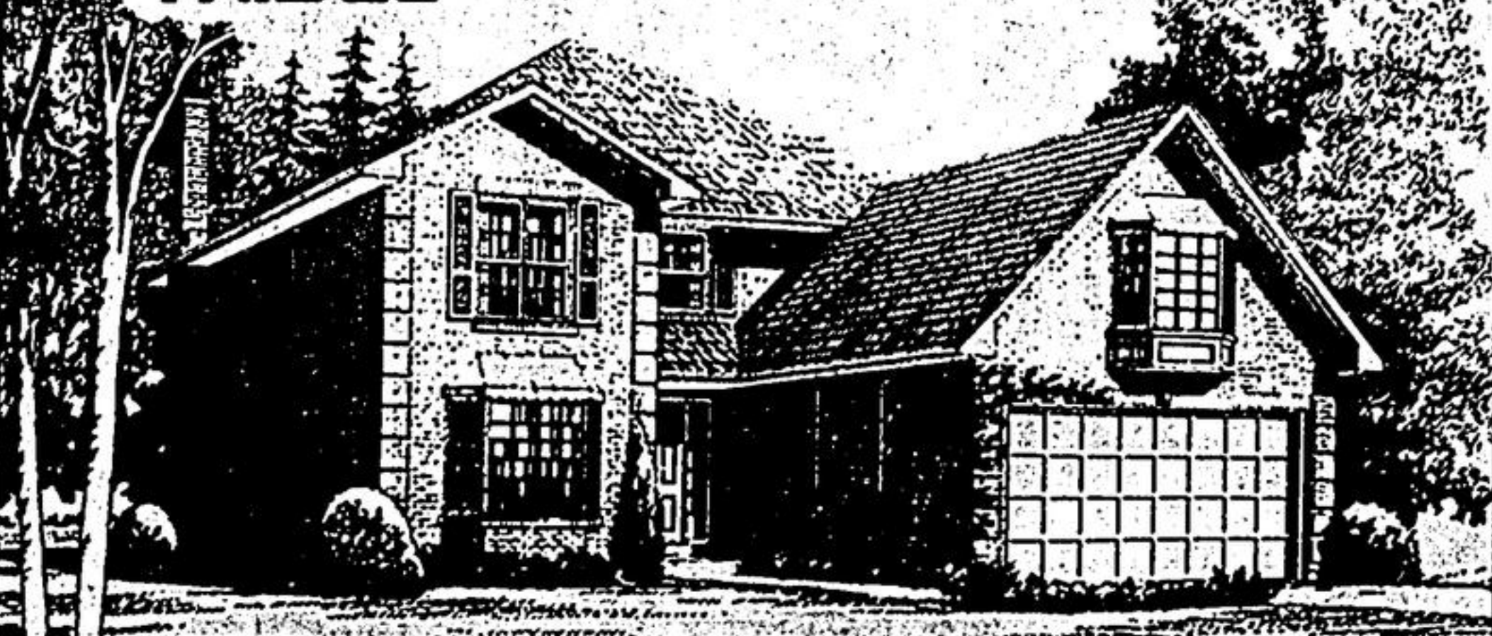
Illustrated: the Amber X $175,900 Artist's Concept