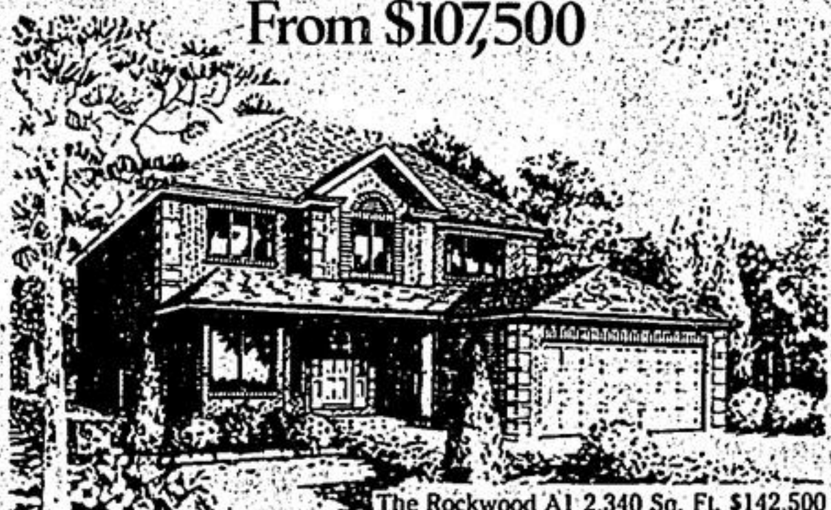
The Rockwood A1 2,340 Sq. Ft. $142,500

Glenway—the builders of imagination have created this country's most exciting new community, Glenway Estates and Country Club in Newmarket. Built around the greens and fairways of an 18 hole golf course, with shopping, transportation and recreation! amenities almost at your doorstep. Now is the time to plan your future in this most attractive residential community. Four spectacular model homes are now open for viewing. Only Glenway gives you THE EDGE, a 2 year builder warranty.