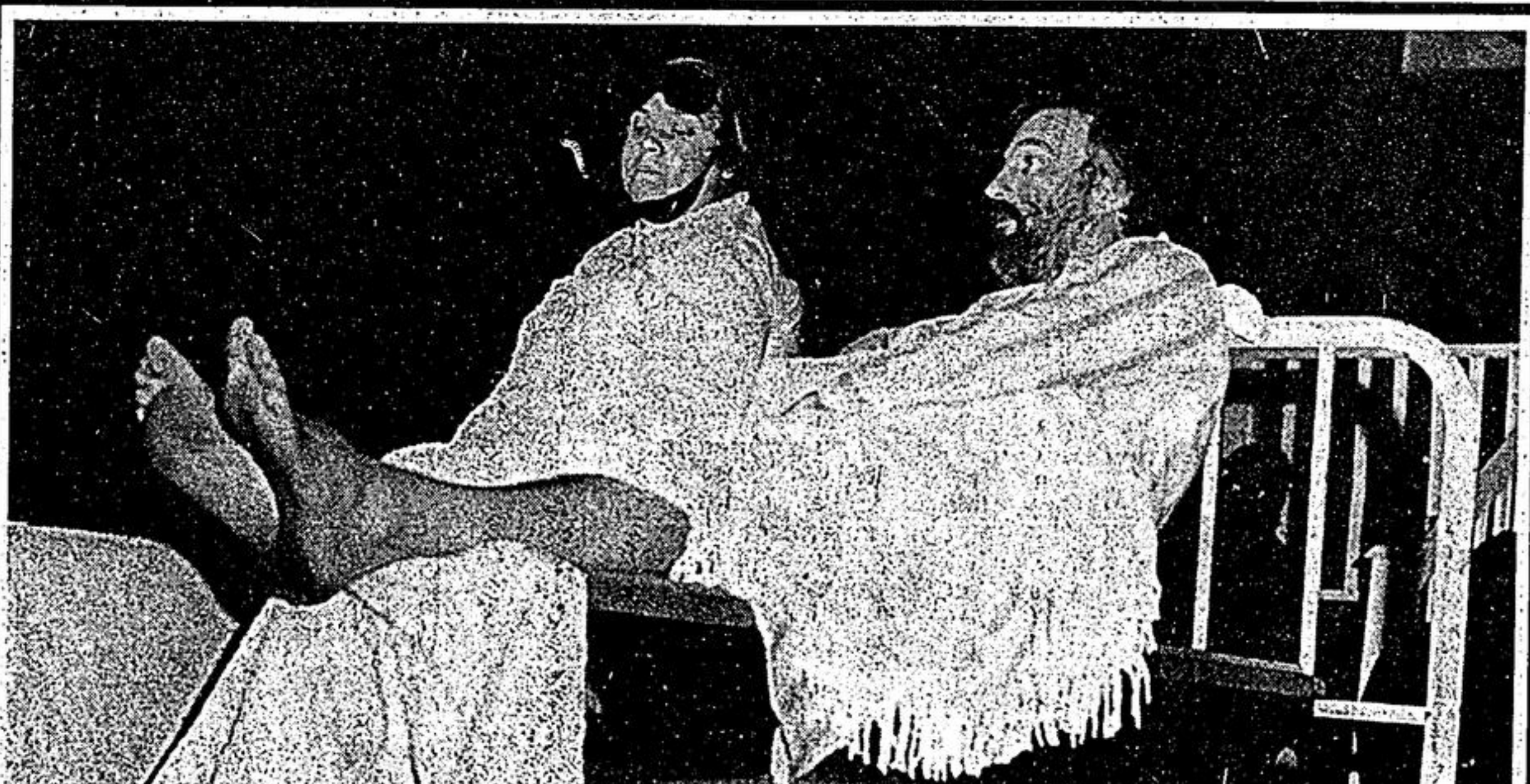
A worried wife, concerned about her successor "when she's gone", presented a humorous bedroom