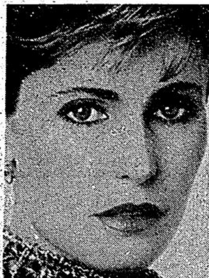
Personal shopping only, please

When you're serious about taking good care of your skin, it shows. We want to help you discover this for yourself by offering this 'See The Results' bonus with any $10 Clinique purchase. We will also give you, at no extra charge, a skin analysis at our Clinique counter. So come in, try some of the new 'Different' lipstick Hybrids—cross blends of colors resulting in never-before shades; see the new lip pencil discoveries and new color techniques for eyes and cheeks. Update your good looks and take advantage of this Clinique bonus offer. 'See The Results' Clinique bonus includes: Status mirror... famous racetrack design. Gel rouge... natural looking, won't rub off on clothes or pillowcases. 7 ml. Balanced makeup base... helps perfect any skin's tone and texture. 15 ml. Clarifying lotion 2... sweeps off dead skin flakes and lets better skin show. 60 ml. Different lipstick... creamy and moist. At Sears Retail stores from March 5-17, 1984. One bonus per customer, please.