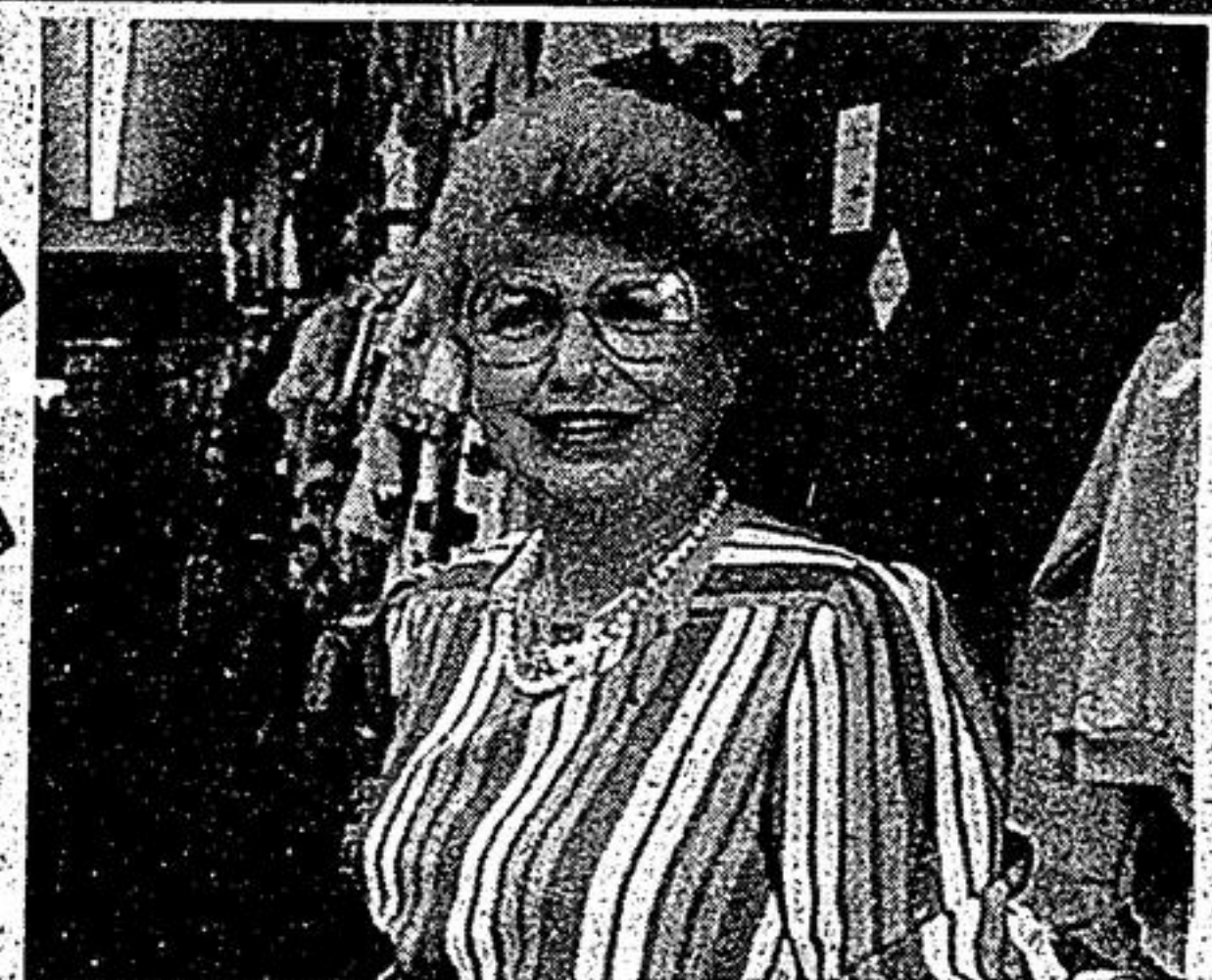
THE SWEATER LADY