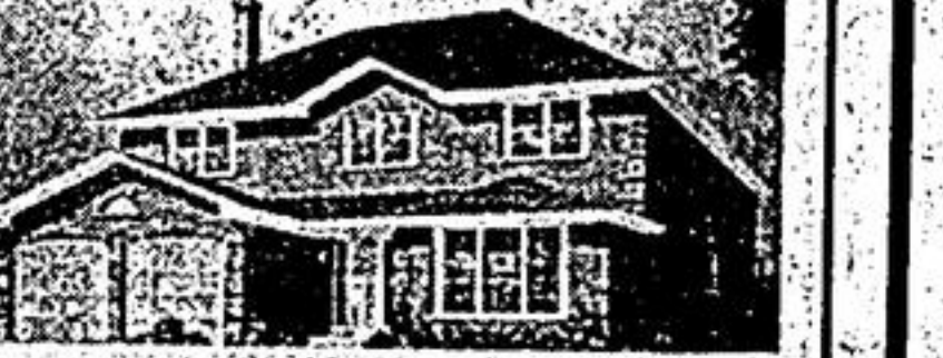
BUILD YOUR OWN HOME Builder will work with purchaser from planning stage through to construction, to finished custom home OR

Buy now. Loaded with extras! Model home, $121,900. Over 2,000 sq.ft. 4 bedroom, circular oak staircase, cornice moulding, country kitchen with walk-out.