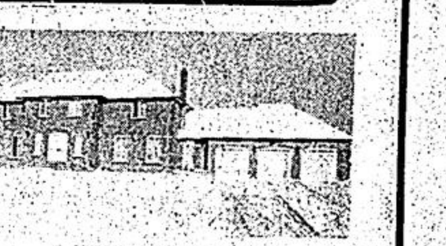
JENNINGS GATE 1 ACRE EXECUTIVE Hwy. 404 & Major MacKenzie. Grand foyer. Separate formal living and dining rooms. Gourmet kitchen with sunny eating area. Quality construction. $349,000. Call Dorothy Mason 474-1710, 887-5381.