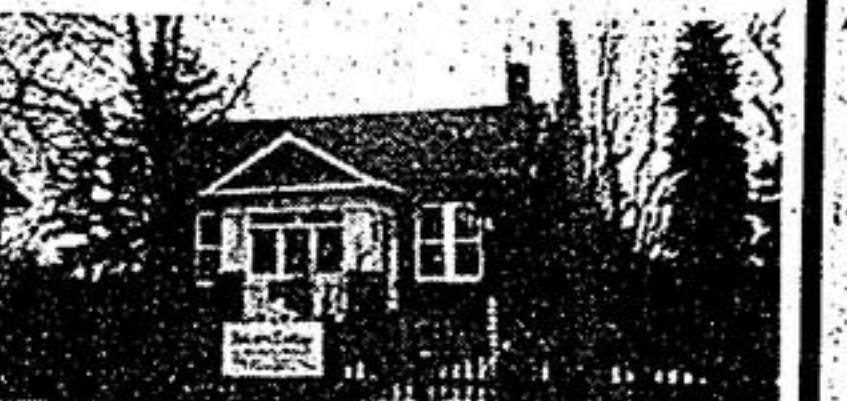
UNIQUE OPPORTUNITY Unicorn cottage, Main St., Unionville, C.1880 and antique business, call Joyce Ramer 294-8844 or 483-1003, Pager 3537 for details.