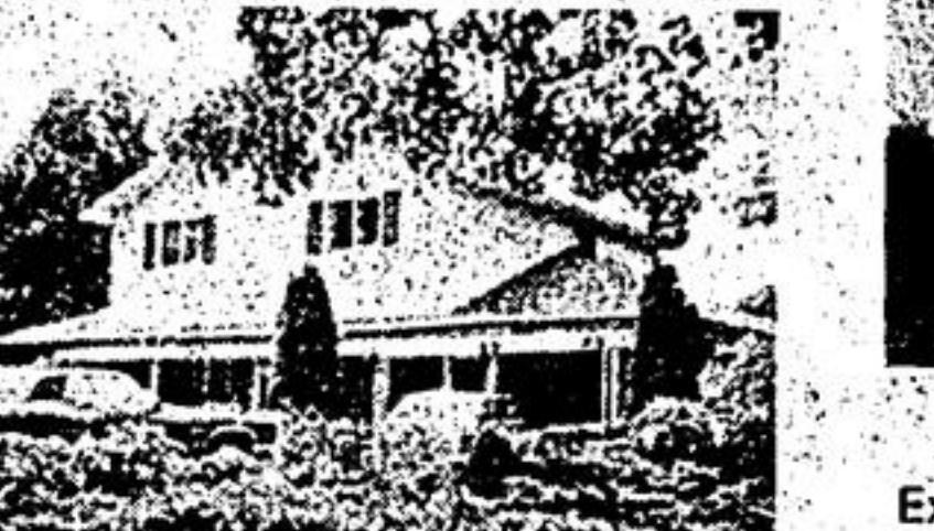
GARDENS & PRIVACY Mature landscaped lot in residential area just south of Uxbridge. 3 bedrooms, large main floor family room with woodstove, eat-in kitchen with view of grounds. Vendor anxious — $95,000. John Whytall.