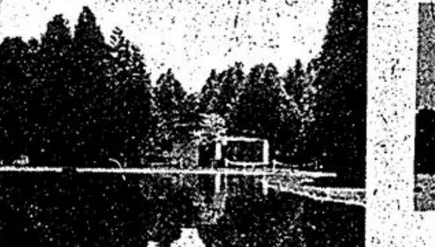
BETHESDA 10-ACRE ESTATE Maintenance free retirement bungalow, in beautiful park-like setting, 2 stocked ponds, stream. Prestige location is just 5 minutes to 404. $189,900. John Whytall has the details.