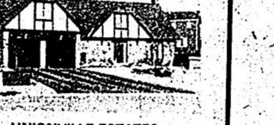
UNIONVILLE ESTATES Exquisite Tudor on 1/4 acre. 5 bedrooms, 3 fireplaces, main floor family room. Inground concrete pool, whirlpool, 4 appliances. Completely finished basement. Shows to perfection. Call Robert Cooper 474-1710, 474-0635.