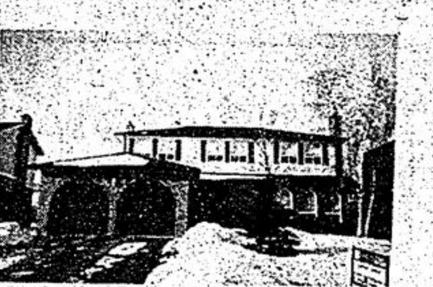
REDUCED TO $169,500 4 bedroom luxury executive — new beige broadloom, 3 fireplaces, 4 baths, 168' lot. Pool. Call now Joyce Ramer 294-8844 or 483-1003 Pager 3537.