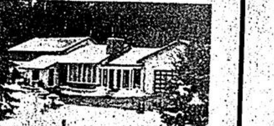
YOUR COUNTRY DREAM HOME Brick/Alum. sidesplit on 16 acres, mature trees, 4 bedrooms, fireplace, solarium, inground pool, exquisite property. Call Robert Cooper 474-1710, 474-0635.