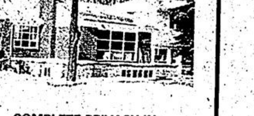
COMPLETE PRIVACY IN HEART OF UNIONVILLE Lot size 116 x 238, 1/2 acre, property enclosed by 14 ft. high cedar hedge, 4 bedrooms, 3 baths, fireplace, rec. room. Call Robert Cooper 474-1710, 474-0635.