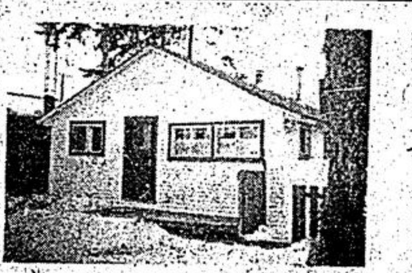
STARTER HOME - $74,900 Good starter or retirement home just north of Stouffville overlooking lake-private beach. Upgraded eat-in kitchen, full basement with rec. room & stove. Living room with stove. Lot 50 x 150. Call Mrs. Northcott 474-1710, 294-1904.