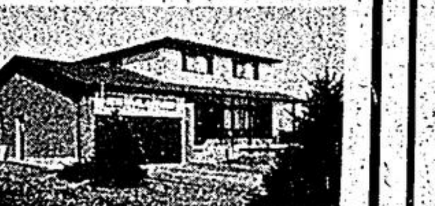
87' x 185' LOT-UXBRIDGE Excellent family home, 4 bedrooms, 2 kitchens, 1 1/2 baths, main floor family room with fireplace and walkout. Nicely decorated, broadloomed. Possession date flexible. Asking $97,900. Barb Sproule.