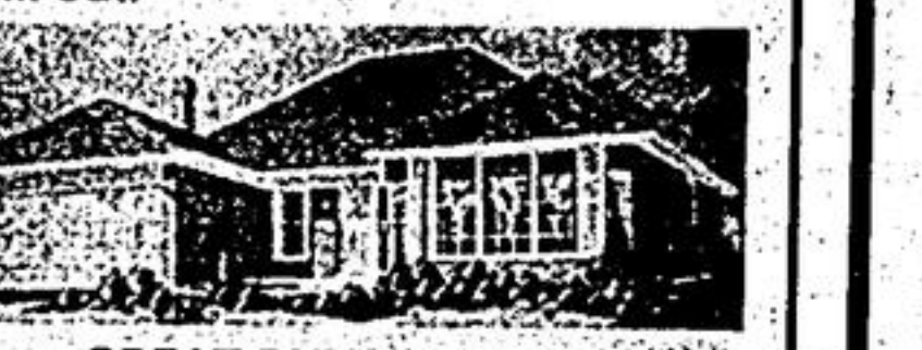
GREAT BUYS IN NEW HOMES! We are building from 8 exciting models. Prices start at $99,700 complete. Open 7 days a week from 10 a.m. Visit us at our model home on Millard St. in Stouffville.

Buy now. Loaded with extras! Model home, $121,900. Over 2,000 sq.ft. 4 bedroom, circular oak staircase, cornice moulding, country kitchen with walk-out.