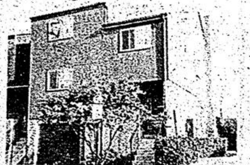
SOLD IN 5 DAYS 646 Village Pkwy. Unit 71.