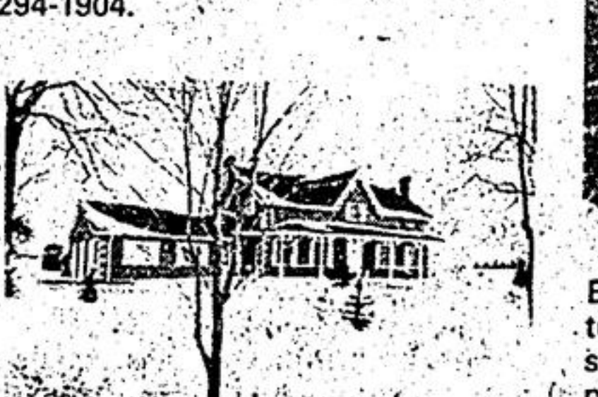
EXQUISITE CENTURY REPRODUCTION ON 1.8 ACRE Quality built home by 'Gavro' with gingerbread trim. Beautiful eat-in kitchen with solid pine cupboards. Main fl. family room with W/O, pine wainscoting & repossessed brick fireplace. Oak panelled den. 3 baths, inground pool 16' x 34'. Triple garage - 5 mins. to Hwy. 404. Call Mrs. Northcott 474-1710, 294-1904.