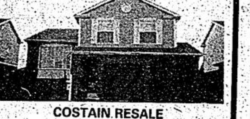
COSTAIN RESALE To see this home, is to want it! Be the envy of your friends, 4 bedroom, main floor, family room with wet bar walk-out. $142,500. Call Joyce Ramer 294-8844, or 483-1003 Pager 3537.