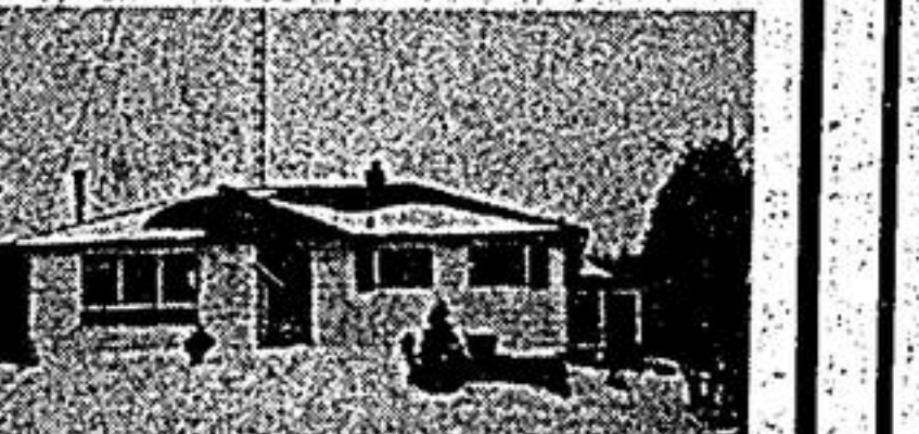
SMALL ANIMAL FARM HORSES 5 acres plus 6 box stall barn with water, hydro and storage, fenced paddocks. Cozy 2 bedroom home with wood stove in rec room. Sun porch facing south ideal for greenhouse. Vikki Le Dez.