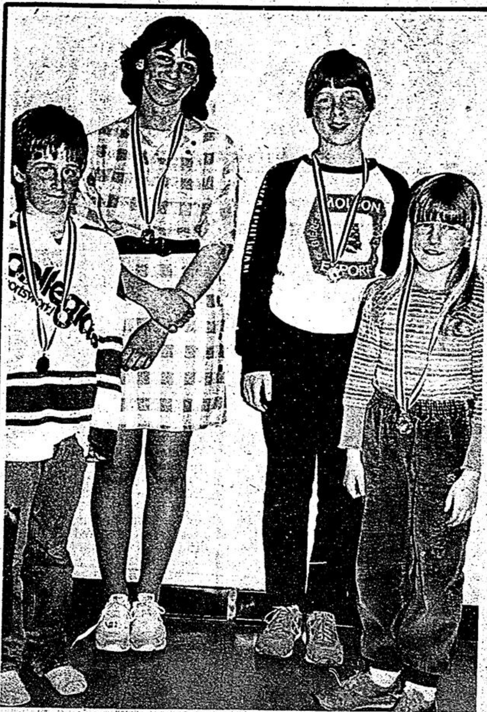
Number one athletes