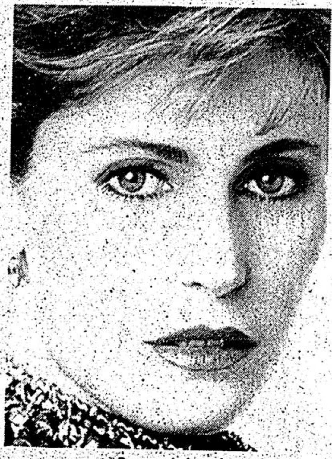
Personal shopping only, please

When you're serious about taking good care of your skin, it shows. We want to help you discover this for yourself by offering this 'See The Results' bonus with any $10 Clinique purchase. We will also give you, at no extra charge, a skin analysis at our Clinique counter. So come in, try some of the new 'Different' lipstick Hybrids—cross blends of colors resulting in never-before shades; see the new lip pencil discoveries and new color techniques for eyes and cheeks. Update your good looks and take advantage of this Clinique bonus offer. 'See The Results' Clinique bonus includes: • Status mirror... famous racetrack design. • Gel rouge... natural looking; won't rub off on clothes or pillowcases. 7 ml. • Balanced makeup base... helps perfect any skin's tone and texture. 15 ml. • Clarifying lotion 2... sweeps off dead skin flakes and lets better skin show. 60 ml. • Different lipstick... creamy and moist. At Sears Retail stores from March 5-17, 1984. One bonus per customer, please.