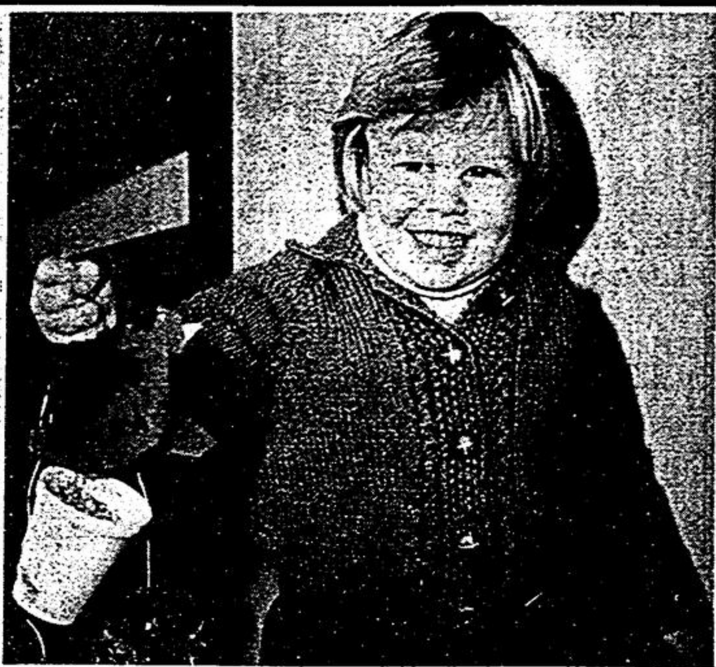
'Look what I made Mom!'