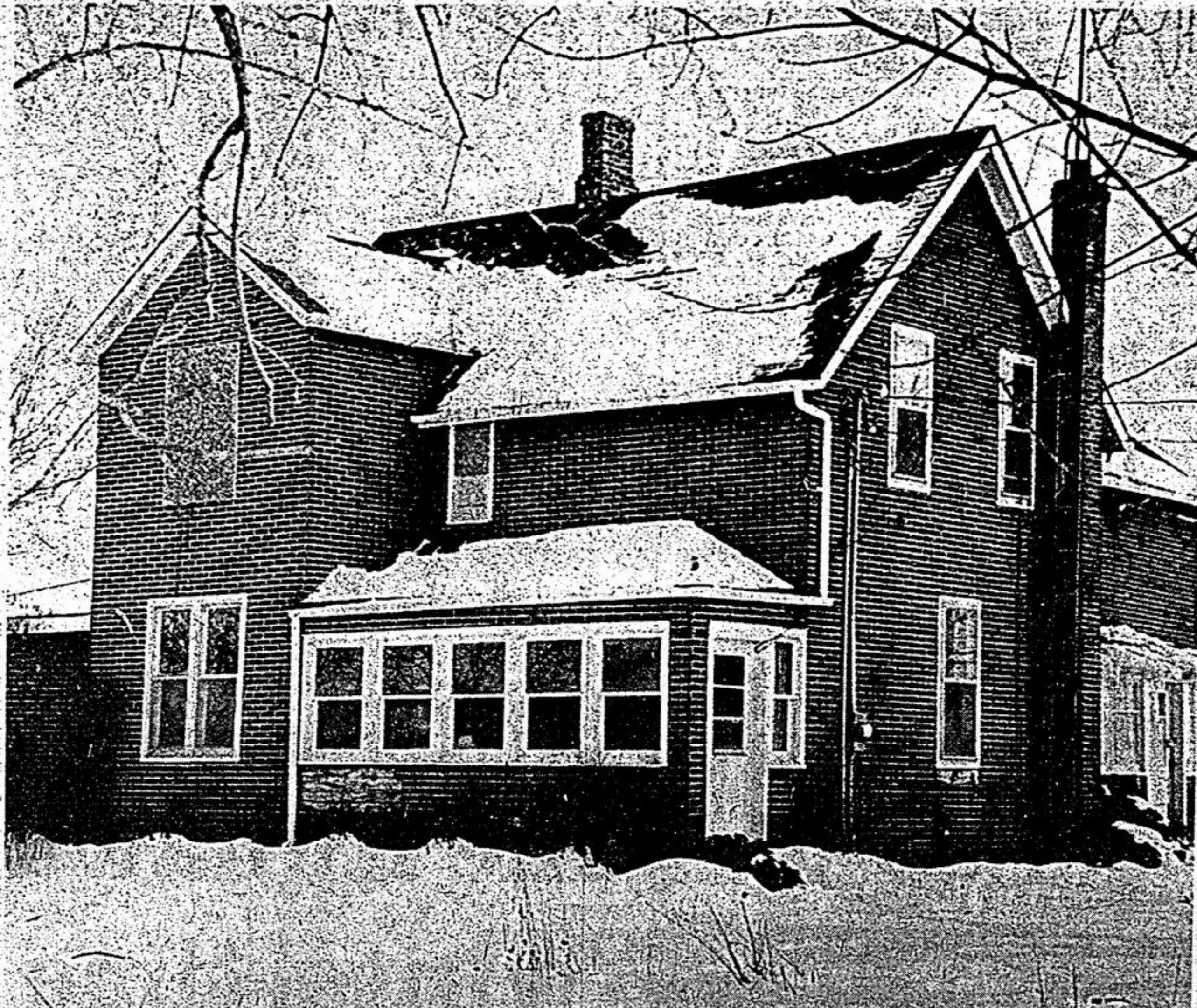
This farmhouse, which is owned by the federal government for the proposed Pickering Airport site, was the site of a two-year-old boy was killed last Thursday. An estimated $60,000 damage was caused, to the house, from a fire which started in an upstairs bedroom.

The amendment to the official plan and a copy of the Commissioner's Report are being forwarded to the Ministry of Municipal Affairs and Housing.