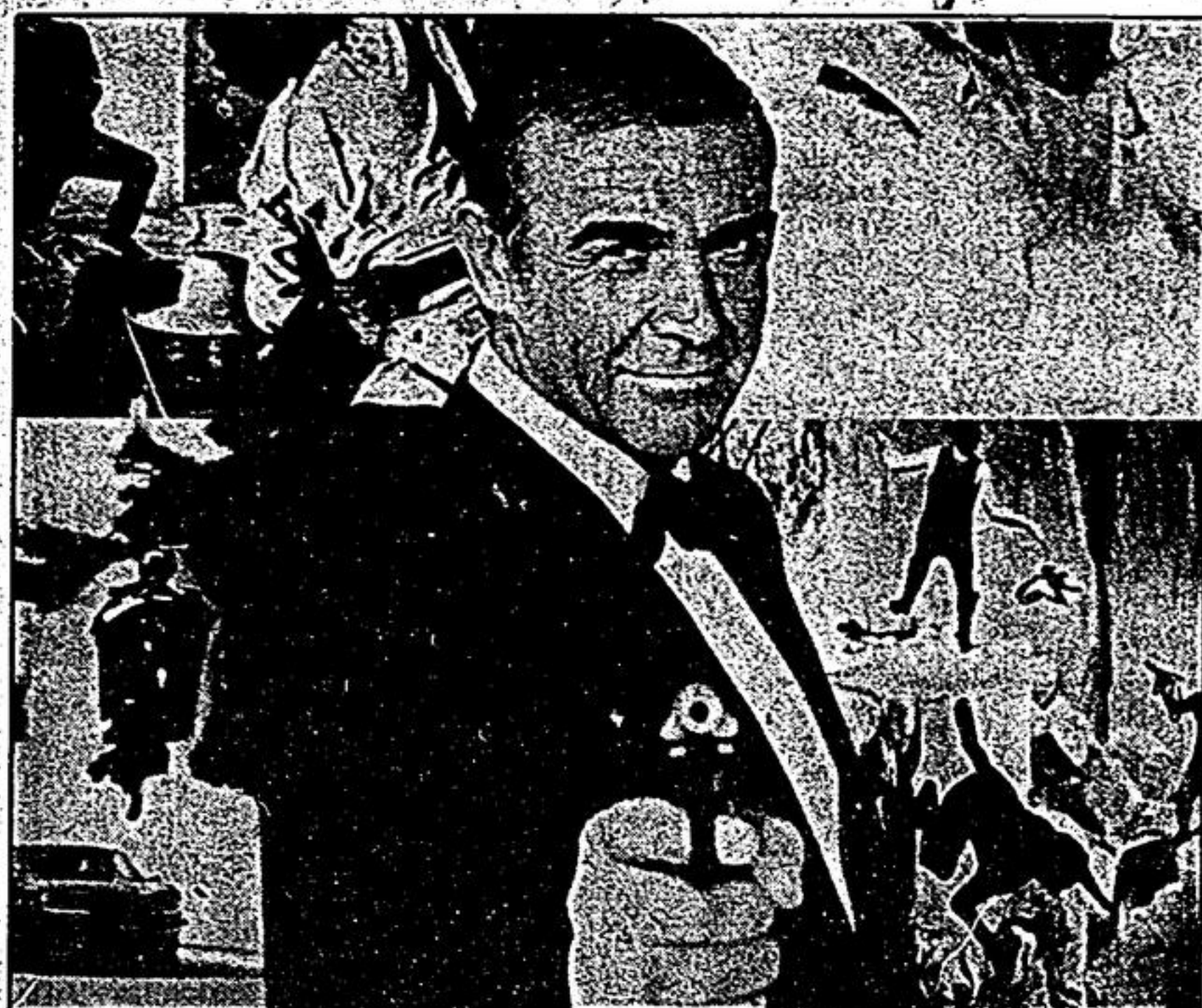
After an absence of several years, Sean Connery has returned to the screen as James Bond in Never Say Never . Again, the movie is playing at Markville Cinema 4.