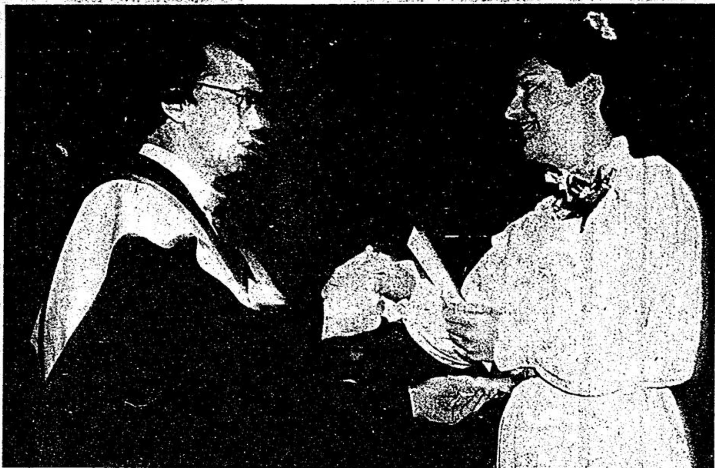
Friday evening was Commencement Night at Stouffville Dist. Secondary School--an occasion to salute the graduates and award recipients of 1983. Recognized many times for her accomplishments in all areas of