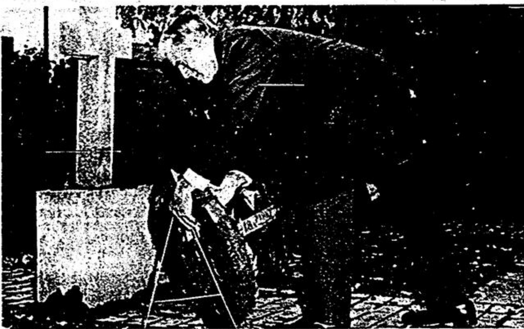
Whitchurch-Stouffville Mayor, Eldred King, places a wreath in front of the cenotaph to pay respect to the men who died during World War I and World War II. The Remembrance Day Service was held Sunday in Stouffville.

Committee members supported the application.