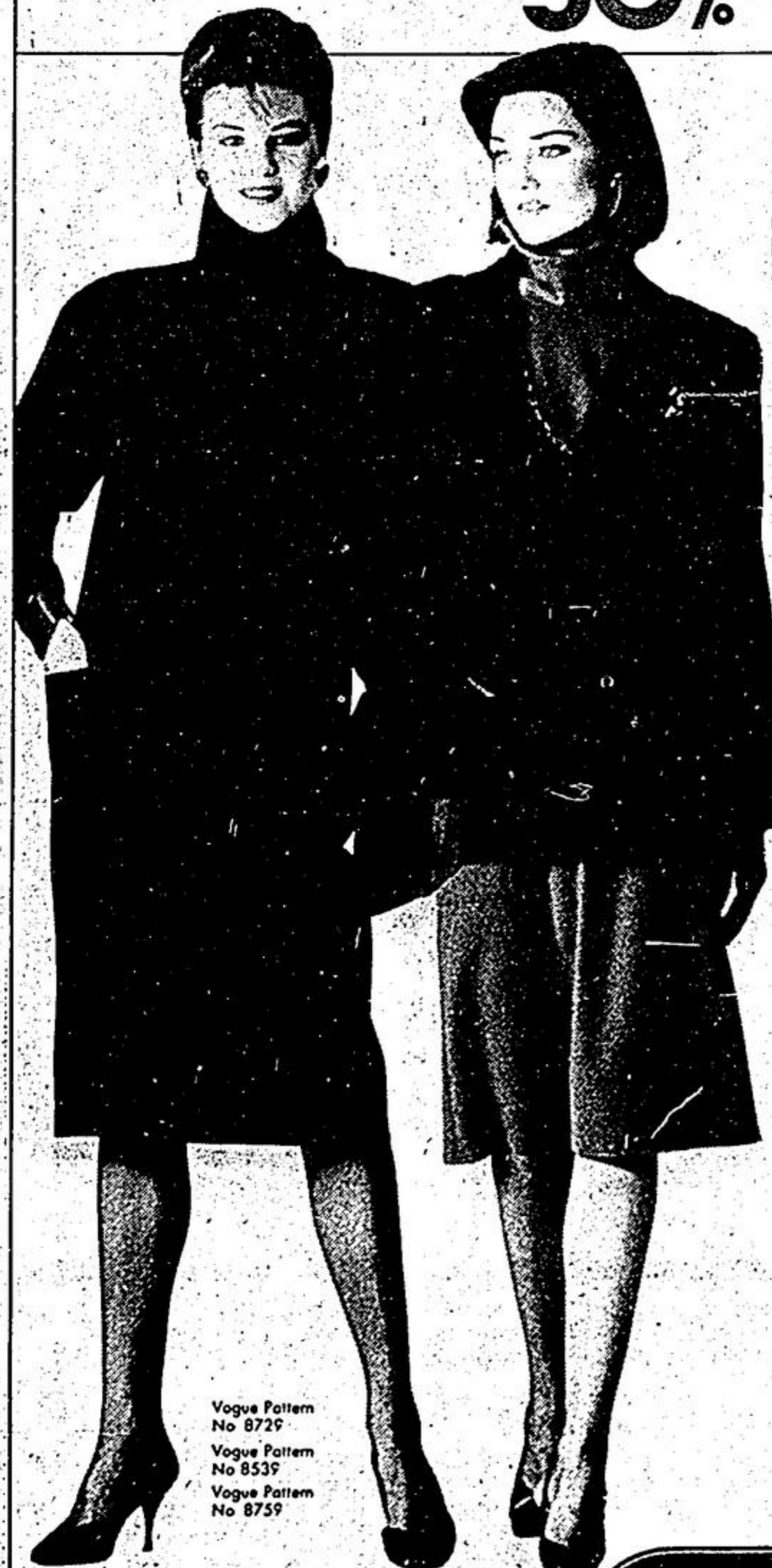
Vogue Pattern No. 8729 Vogue Pattern No. 8539 Vogue Pattern No. 8759

If you sew, all Fall's great new looks can be fabulously affordable! Because right now we're offering up to 50% off on a super selection of Fall fabrics. Our friendly and knowledgeable staff are always ready with any advice you may need. So for the best selection, advice and prices that are sew affordable, visit Fabricland today!