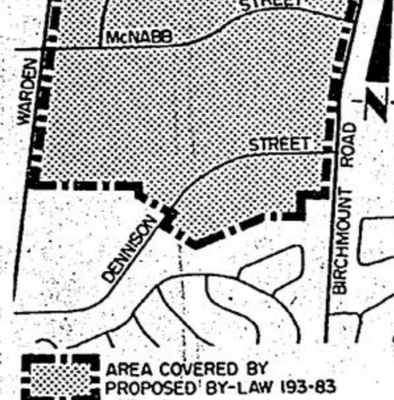
AREA COVERED BY PROPOSED BY-LAW 193-83

A STORE IS BORN YES - BUT WITHOUT YOU - WE ARE NOTHING GRAND OPENING SATURDAY OCT. 15/83 JOIN MAYOR AL DUFFY FOR CEREMONIES AT 11:00 A.M.