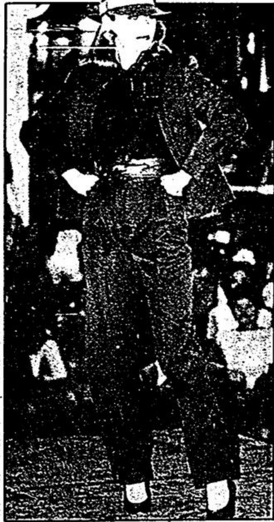
Pants are definitely in this fall, especially with striking outfits like this two-piece wool co-ordinate with leather belt and silk blouse.