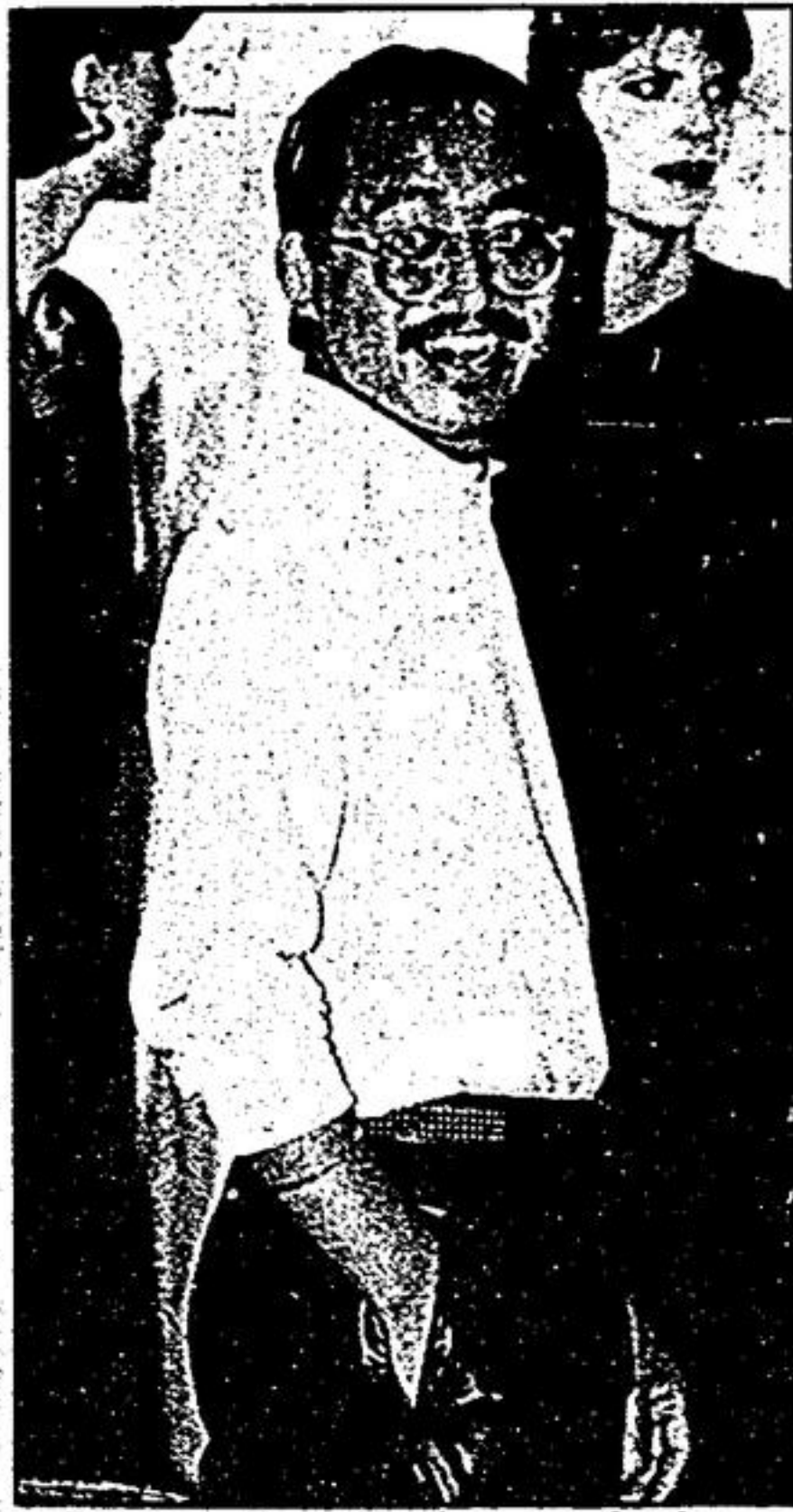
Internationally-known designer Alfred Sung was on hand Friday at Markville Shopping Centre where his designs were featured in a fashion show.