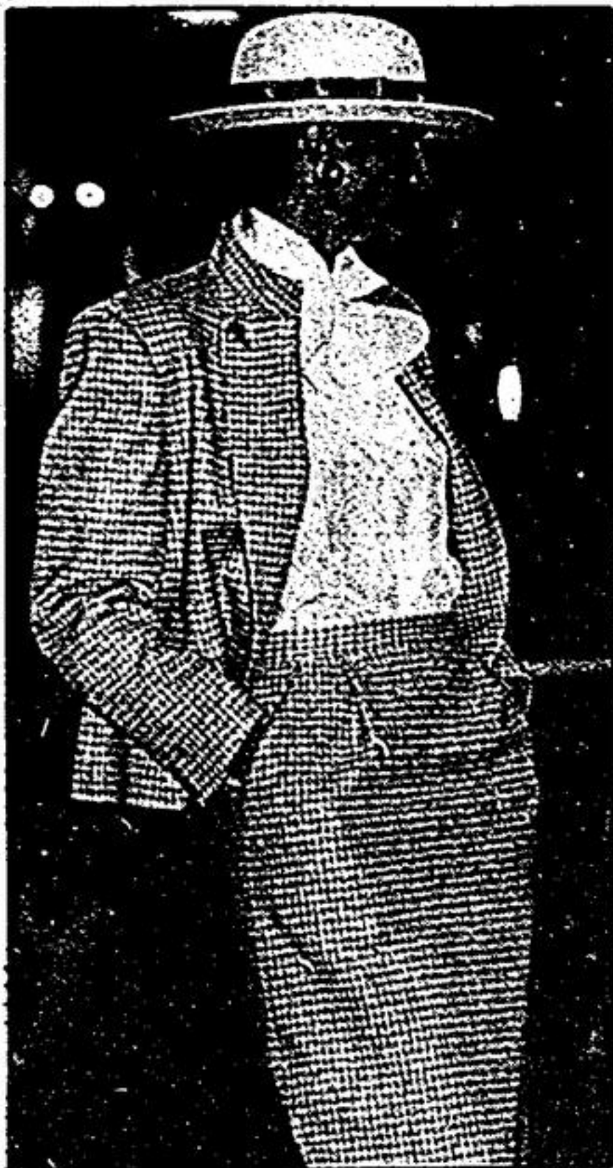
Suits for the business woman need not be plain as this camel hair and nylon outfit demonstrates. The blouse is 100 per cent silk. — Sjoerd Witteveen