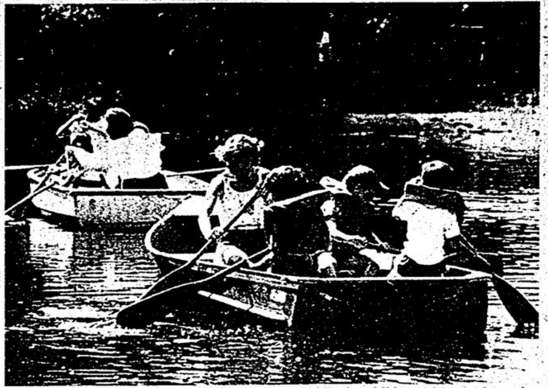
Glenbrook Day Camp on McCowan Road, R.R. 2, Markham, is "heaven on earth" for hundreds of children every summer. In addition to "fun and games", the children also receive spiritual instruction that will stand them in good stead in the years that lie ahead.