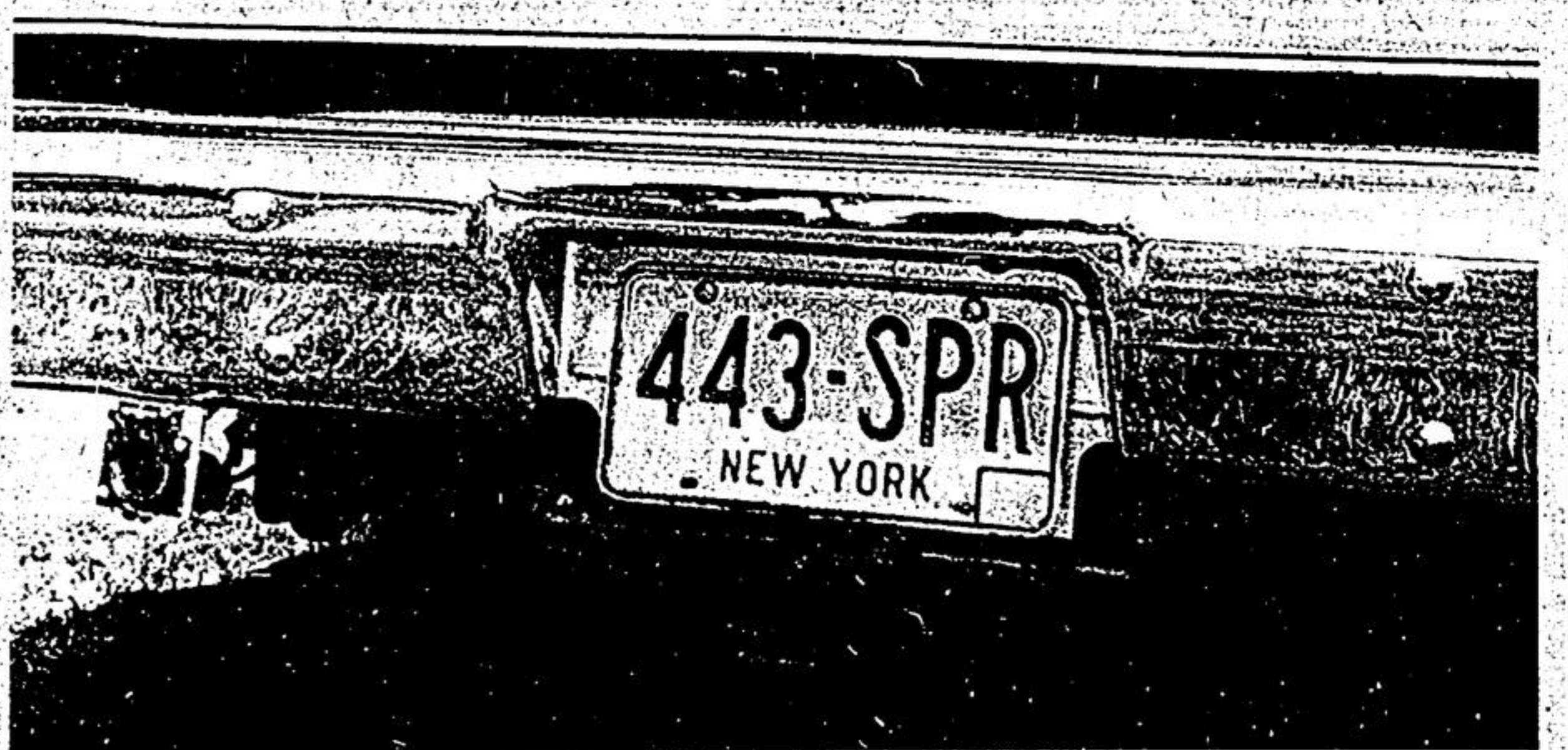
License plates from all 48 states and all provinces of Canada are familiar throughout the grounds. Many transient travellers are here this summer for a first