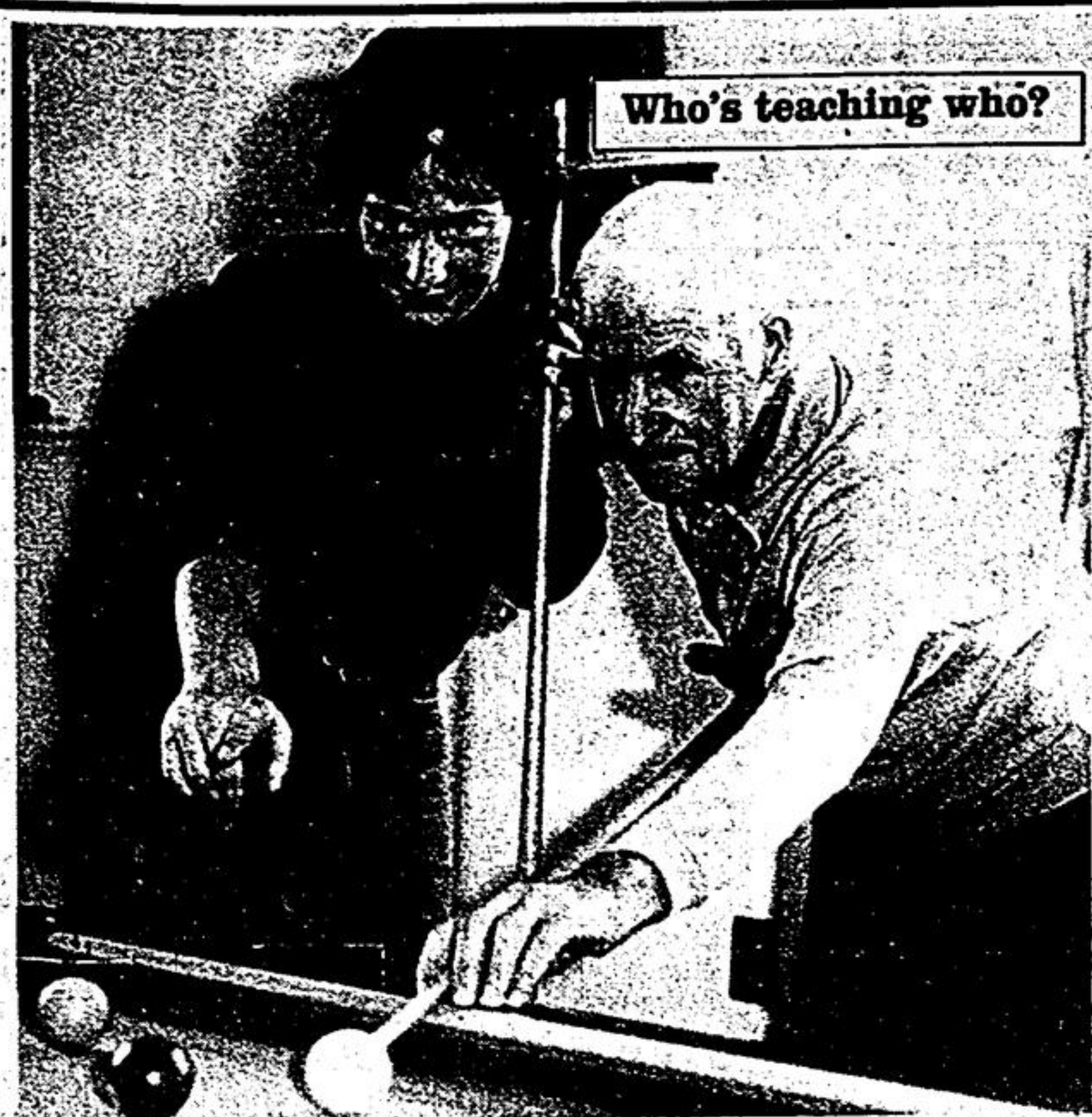
Who's teaching who?