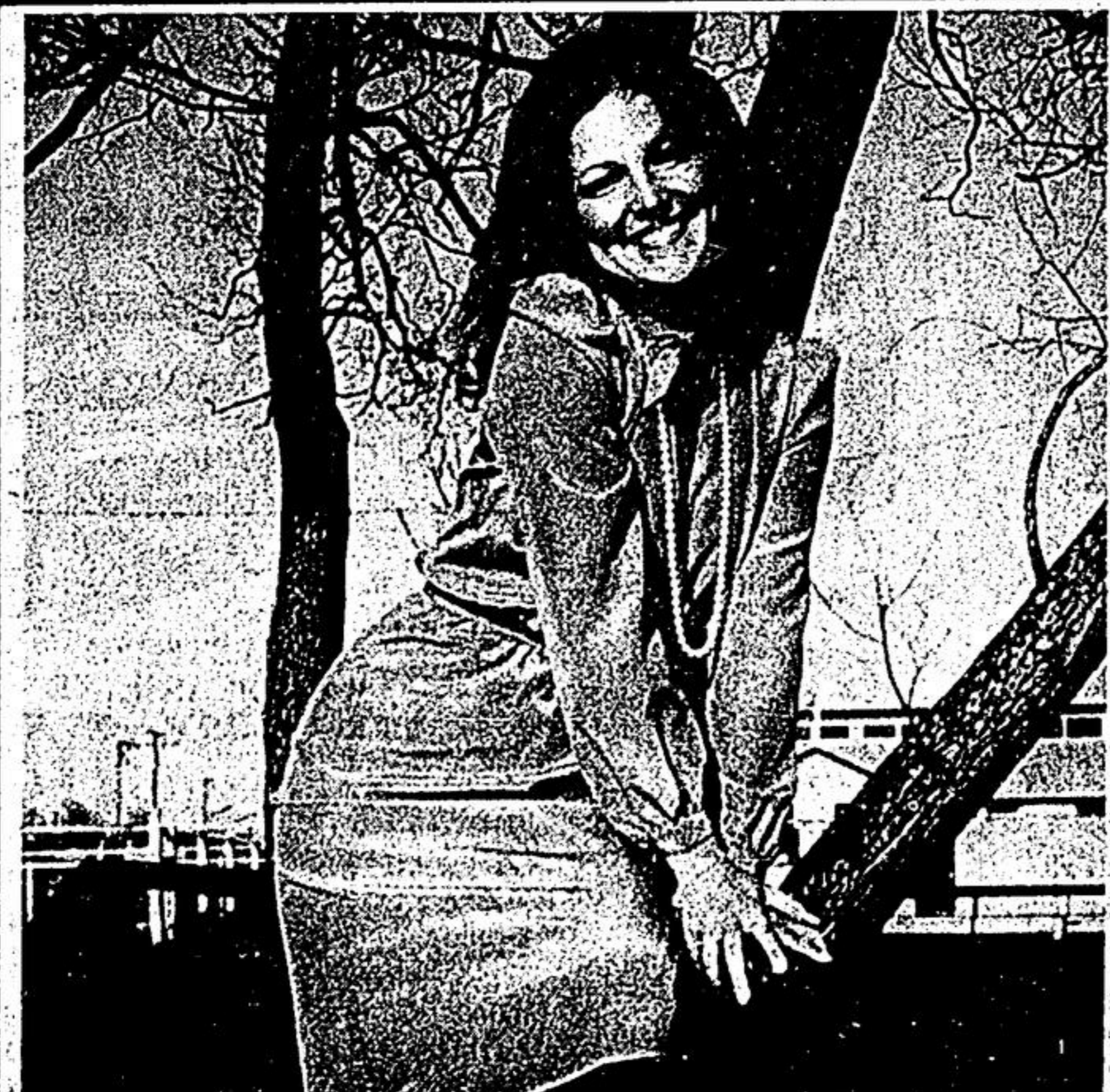
"Fashion in Action" May 25

This service was contained in an agreement worked out by the Town and owners of the landfill site as part of a compromise in allowing dump operations to continue into 1985.