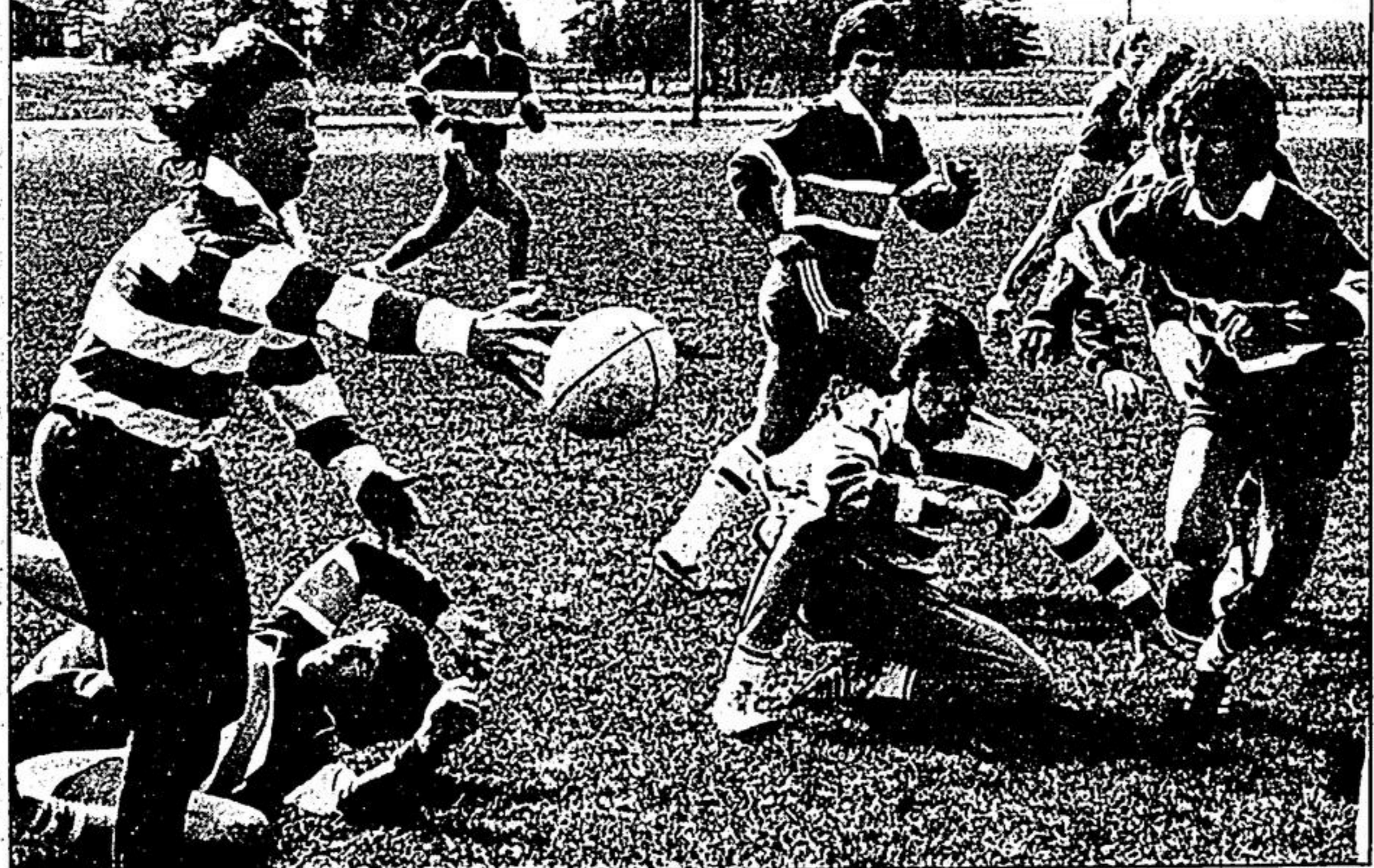
He who has the longest arms...keeps the ball