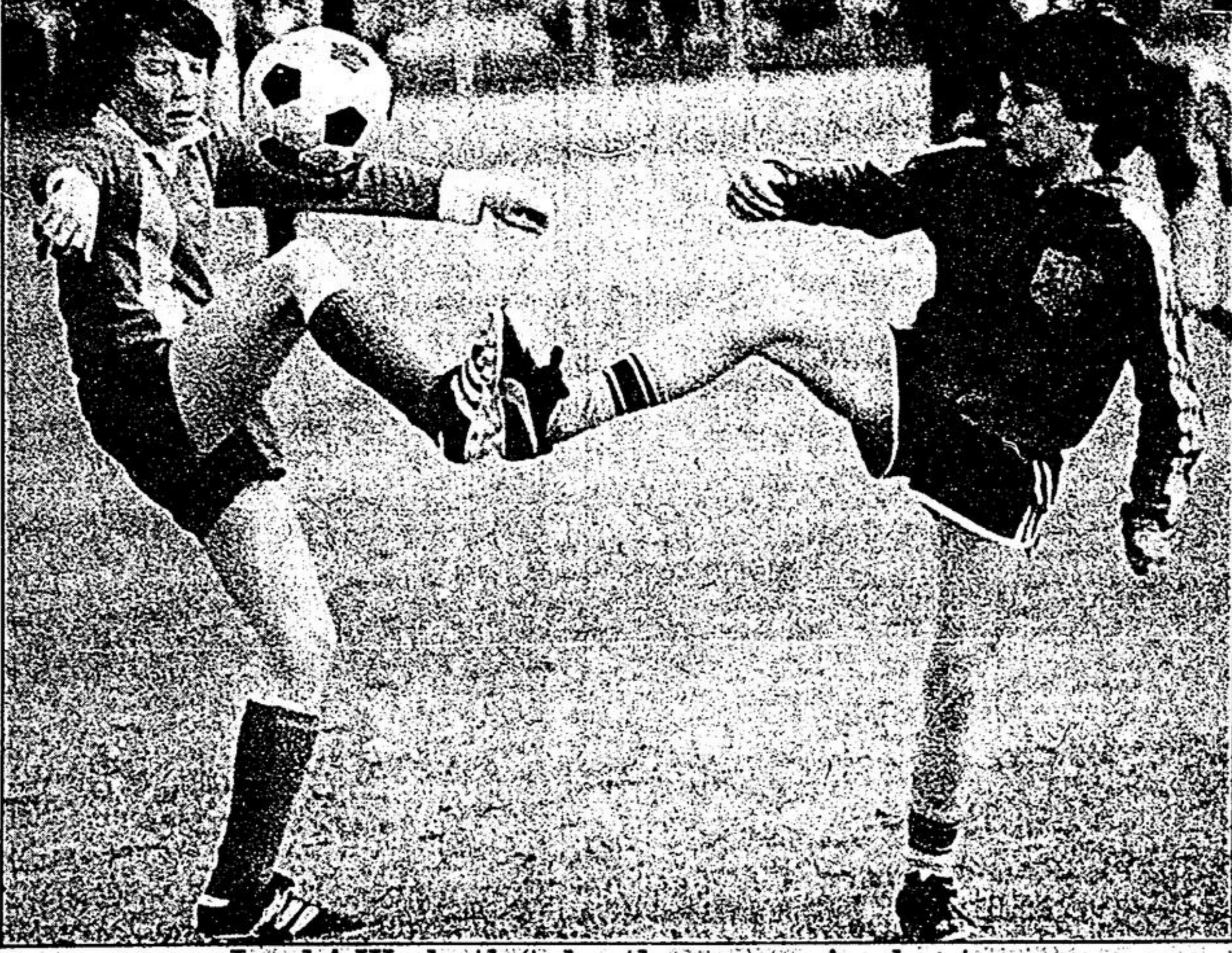
Look! We both take the same size boots

is proving far superior to previous years. The practice of trying out full teams against visiting clubs is one of the most successful ideas yet, giving coaches a much better idea of a player's ability when he is under real pressure. This coming Saturday the tryouts will continue against visiting teams from Agincourt and Malvern. Some coaches have already filled their rosters, but have left a couple of empty slots on their slate to accommodate late talent. The final tryout schedule will again be held at Ballantrae Park and is as follows: Panthers (minor mosquitos) 9:30 to 10:45 a.m. Major mosquitos 10:45 to 12 noon. Squirts 12 noon to 1 p.m. Castle Royals (minor peewees) 1 to 2:30 p.m. Tigers (minor atoms) 2:30 to 3:45 p.m. Major atoms 3:45 to 5 p.m.