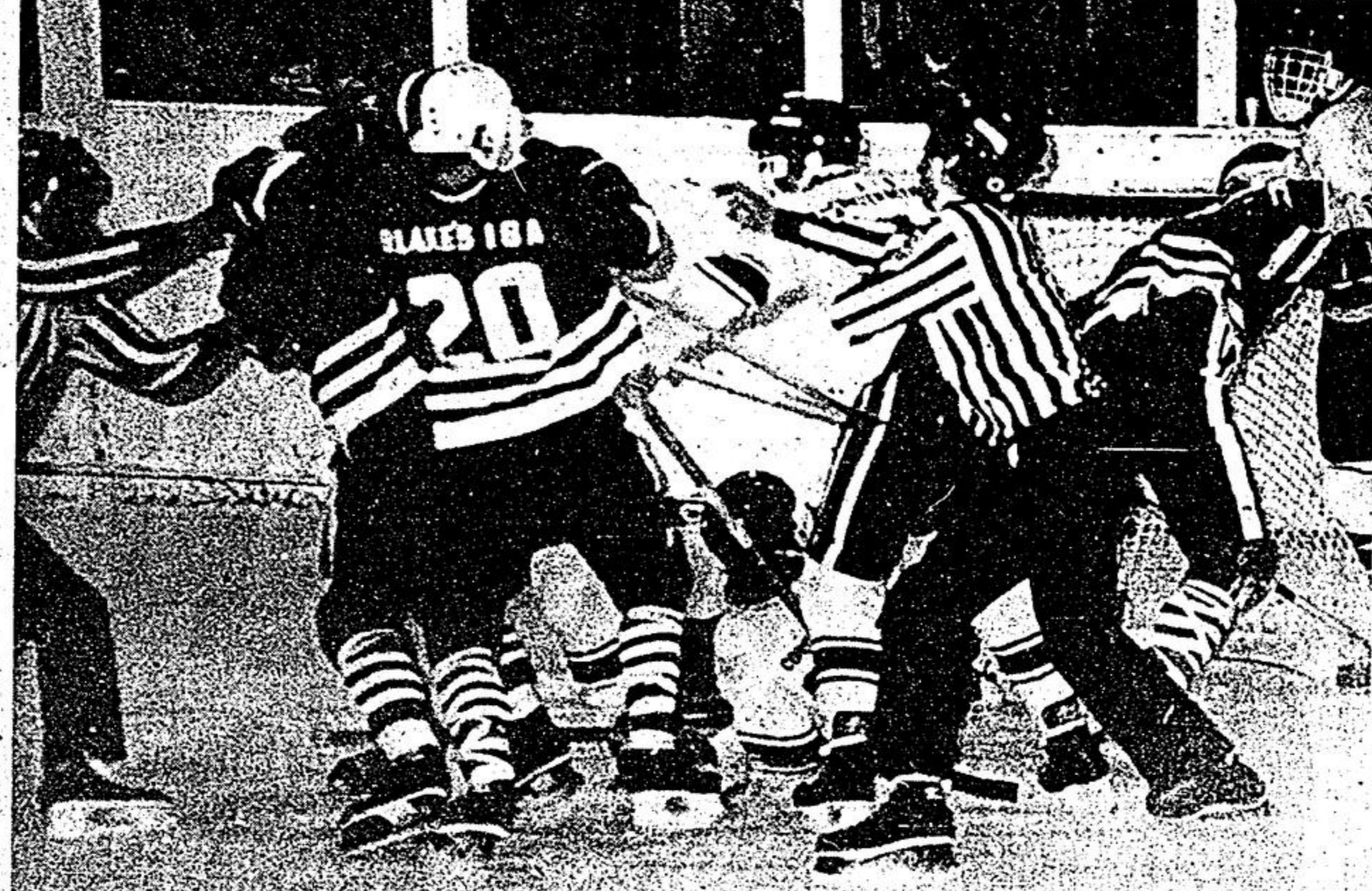
When playoff time draws close referees really earn their money: Saturday night's Junior 'C' game between Lakefield and Stouffville was not short of action, but when you are fighting for a playoff spot tempers can get a little frayed. Not surprisingly, there was no shortage of penalties.