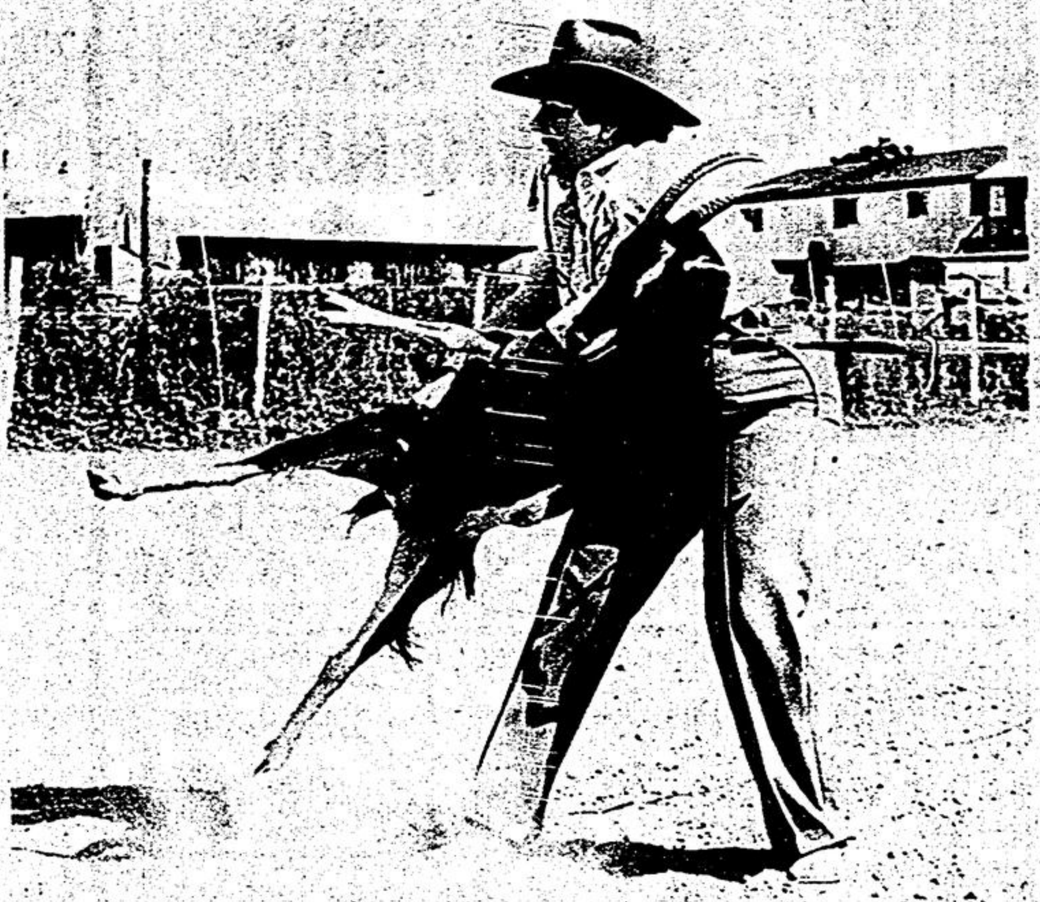
Which way is up?