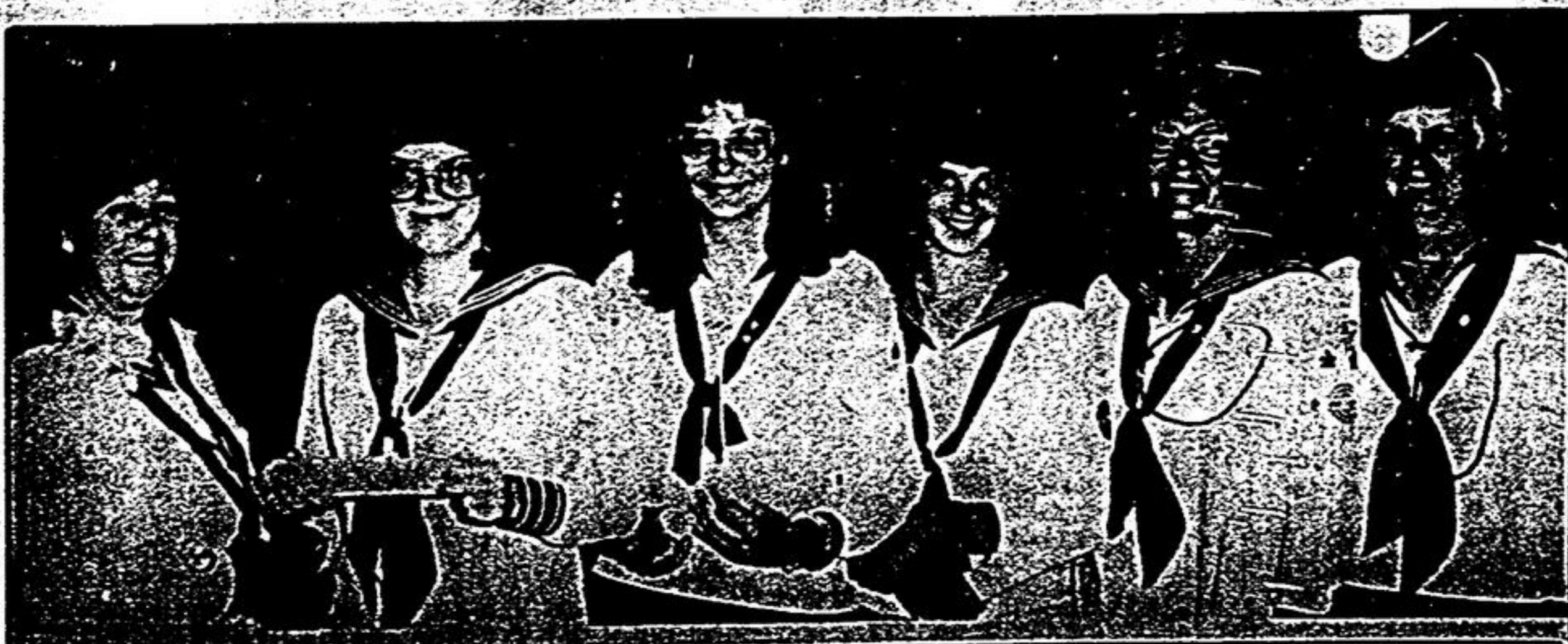
Stouffville CGIT graduates receive diplomas at ceremony