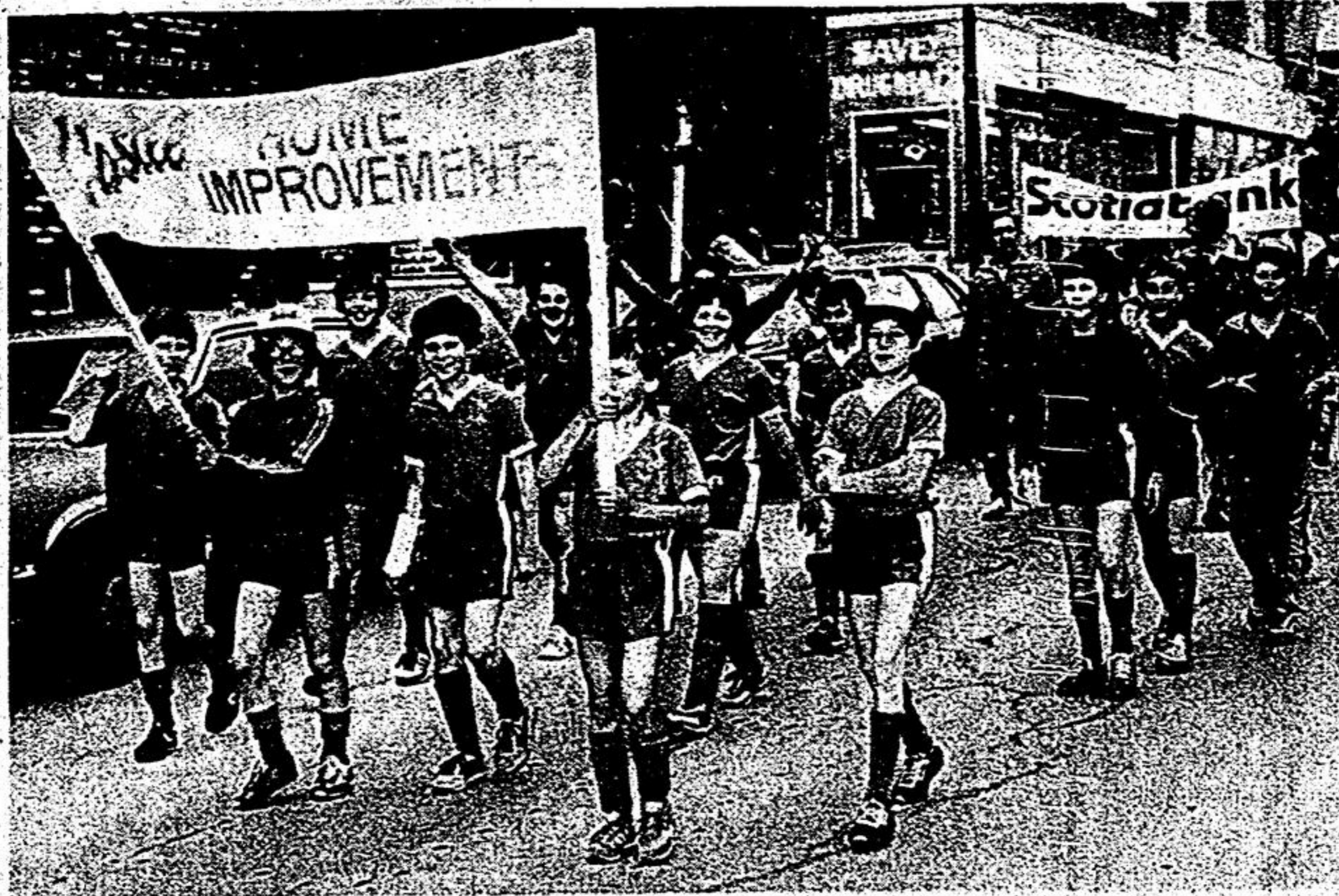
Miserable weather failed to dampen the enthusiasm and high spirits of these young players in Saturday's soccer club parade. Twenty two teams took part, all sponsored by local businesses and service clubs.