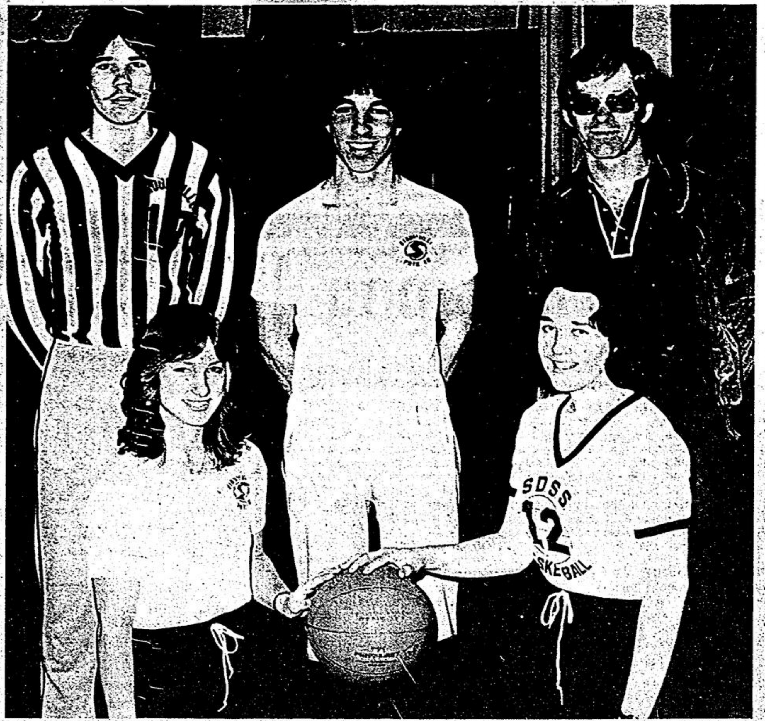
Top scorers in Foul Ball contest

with a game at the arena at 7:00 p.m. The Oldtimer lineup will be identical to the one entered in the recent World cup series.