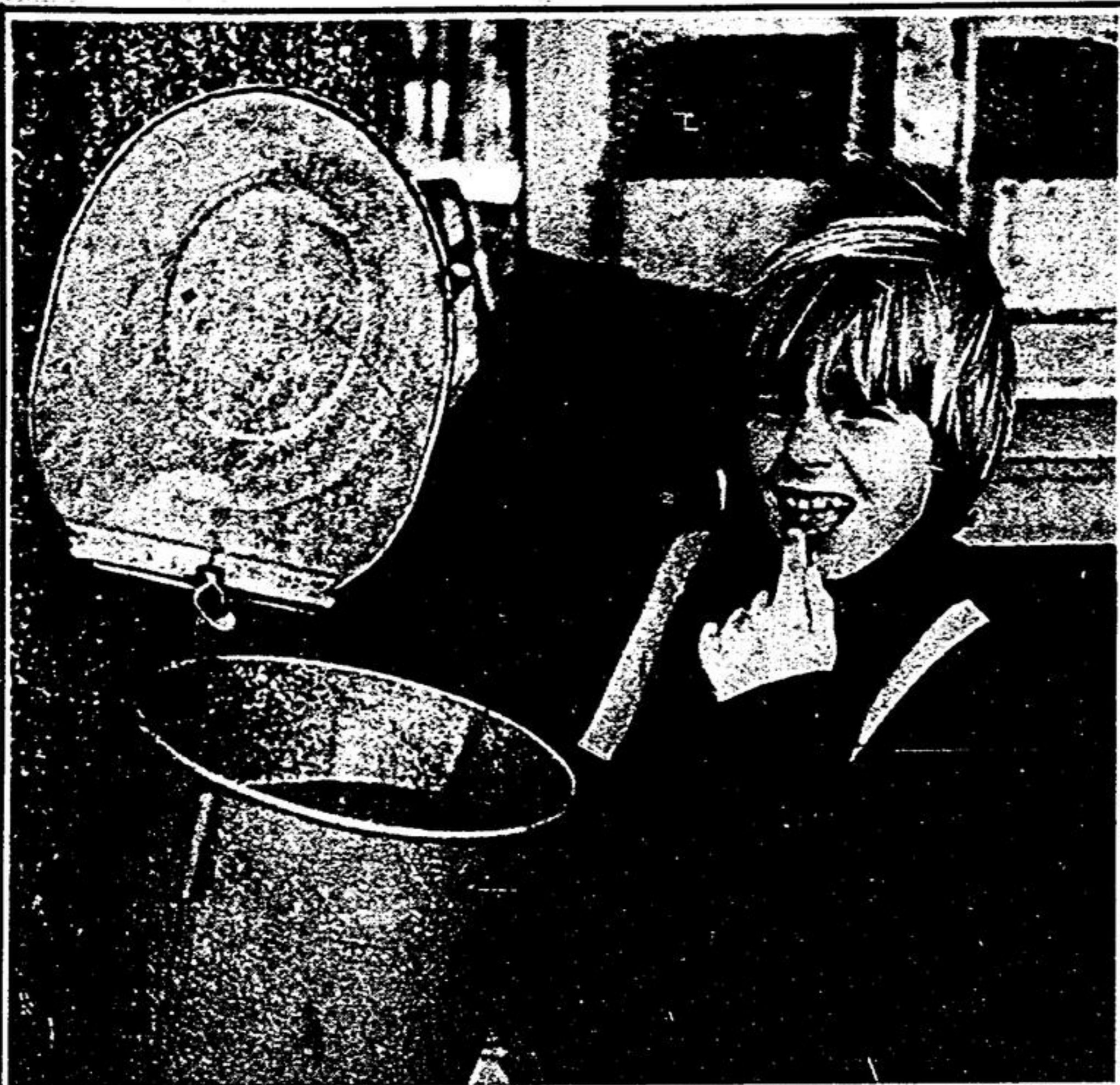
The sap's on tap at Bruce's Mill Conservation Area

No smoking will be allowed, also persons planning to attend should refrain from using perfumes or aftershave. The meeting room will contain no carpet.