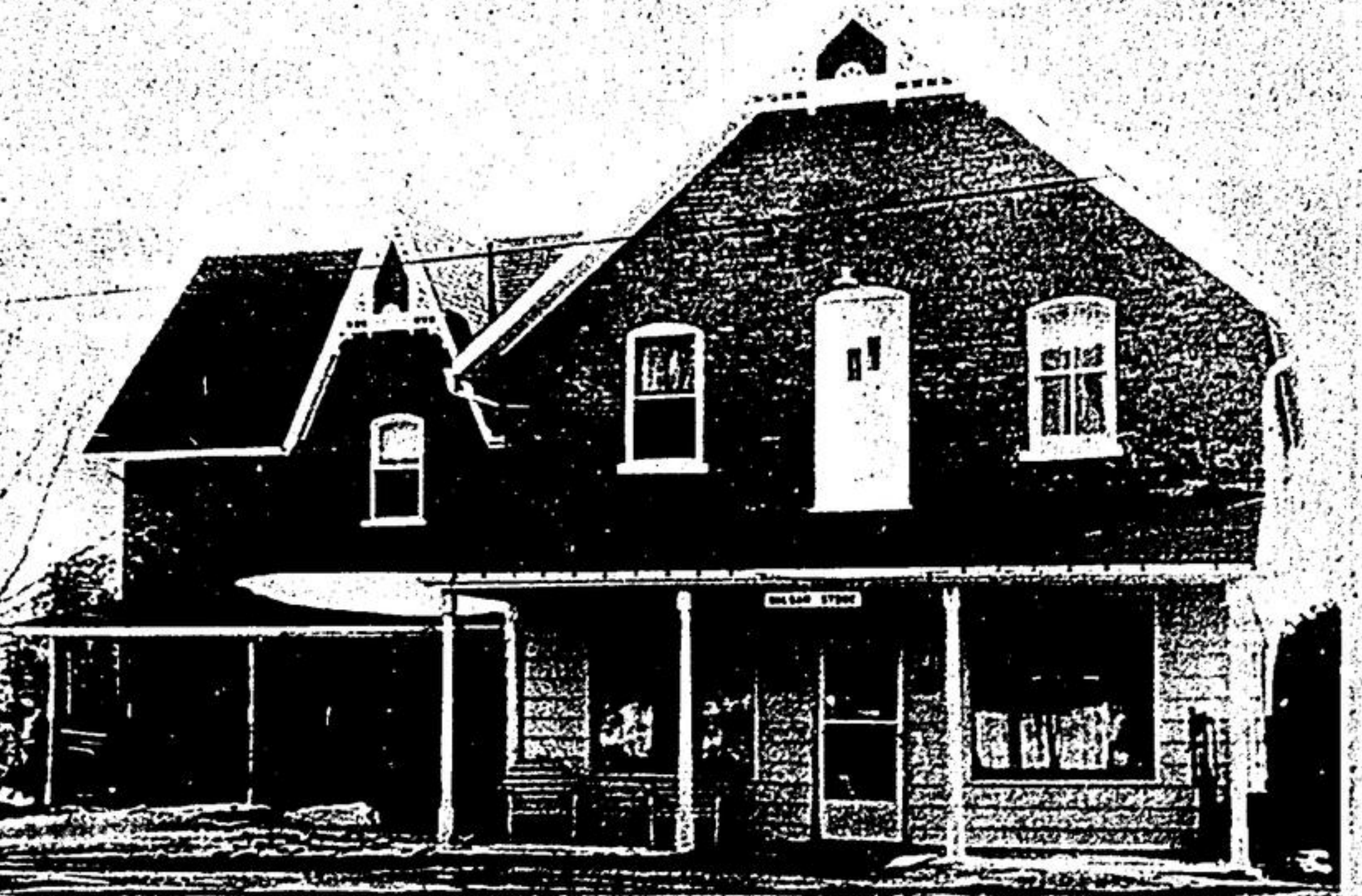
Balsam General Store was the scene of an armed robbery, March 11, when a youth with a knife demanded money from the till. Owner