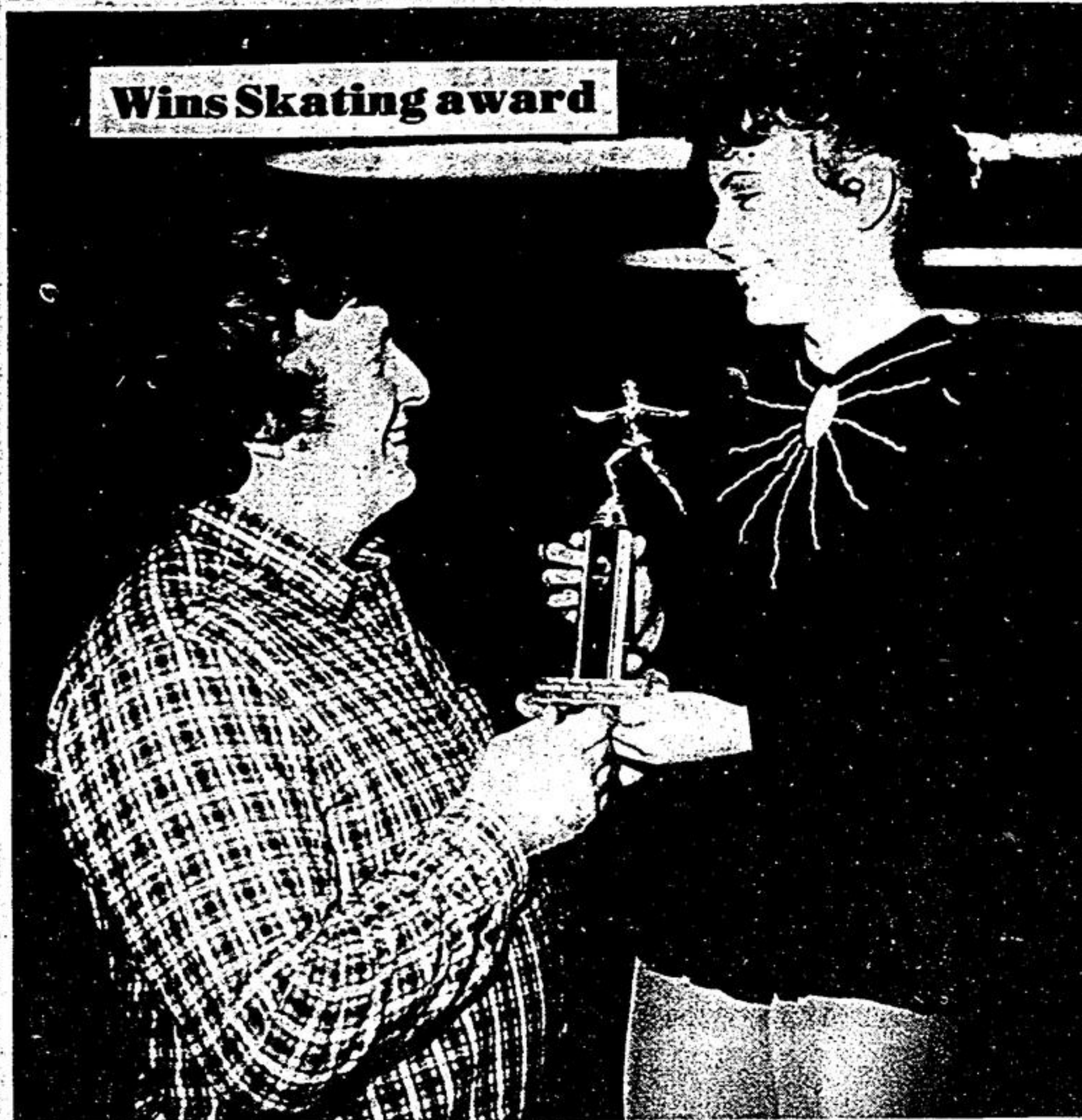
Wins Skating award