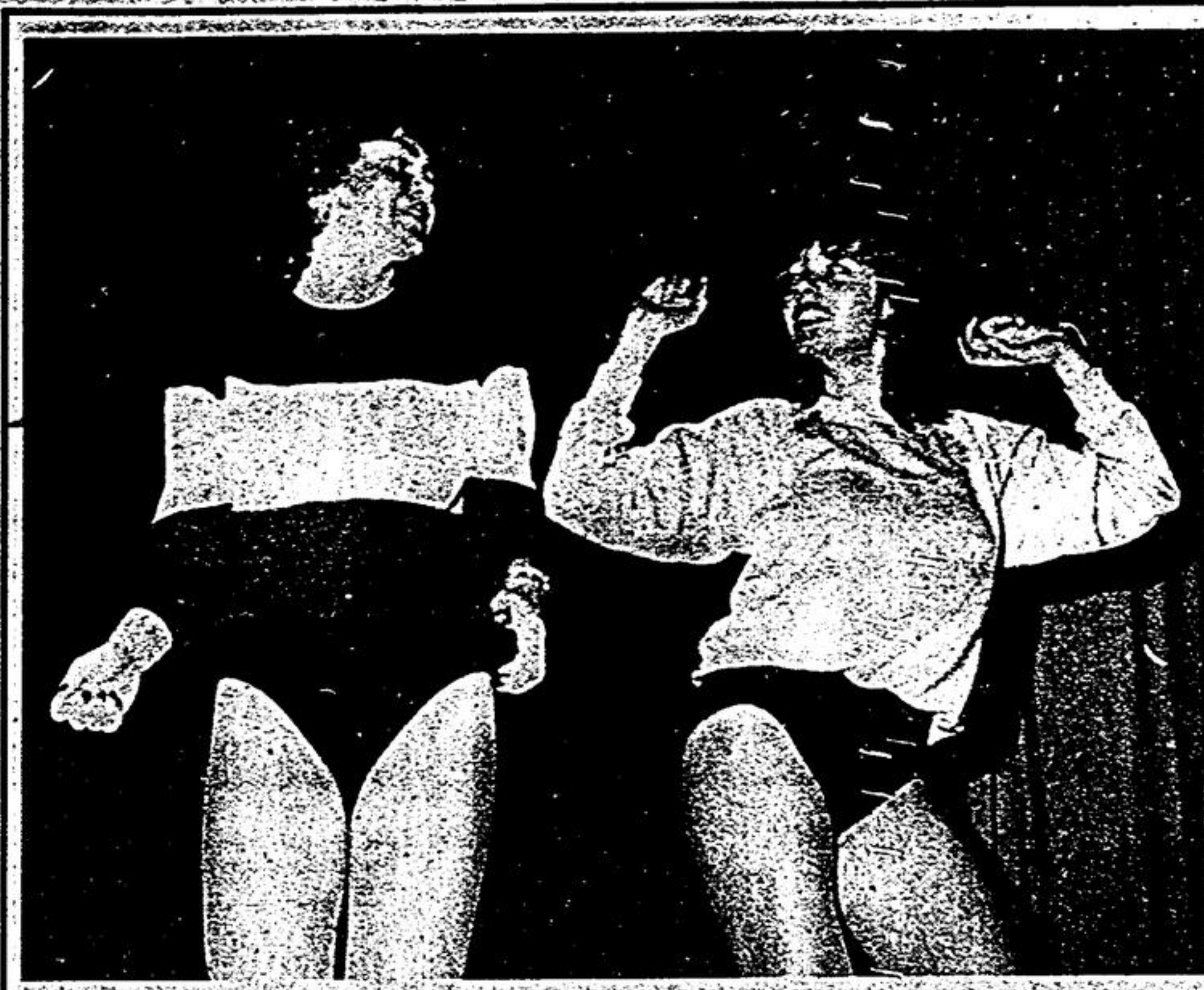
Dance routines featured at high school Variety Show

announced at a dance at Cedar Beach Pavilion, Musselman's Lake. Admission is $35 per couple including chances for additional prizes valued at $500. Only 220 tickets are being sold.