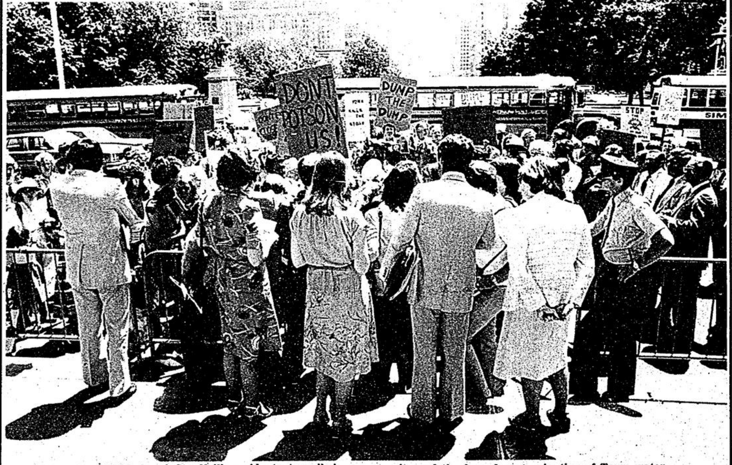
A delegation of Whitchurch-Stouffville residents, travelled to Queen's Park to protest the continued operation of a landfill site and the feared contamination of Town water.