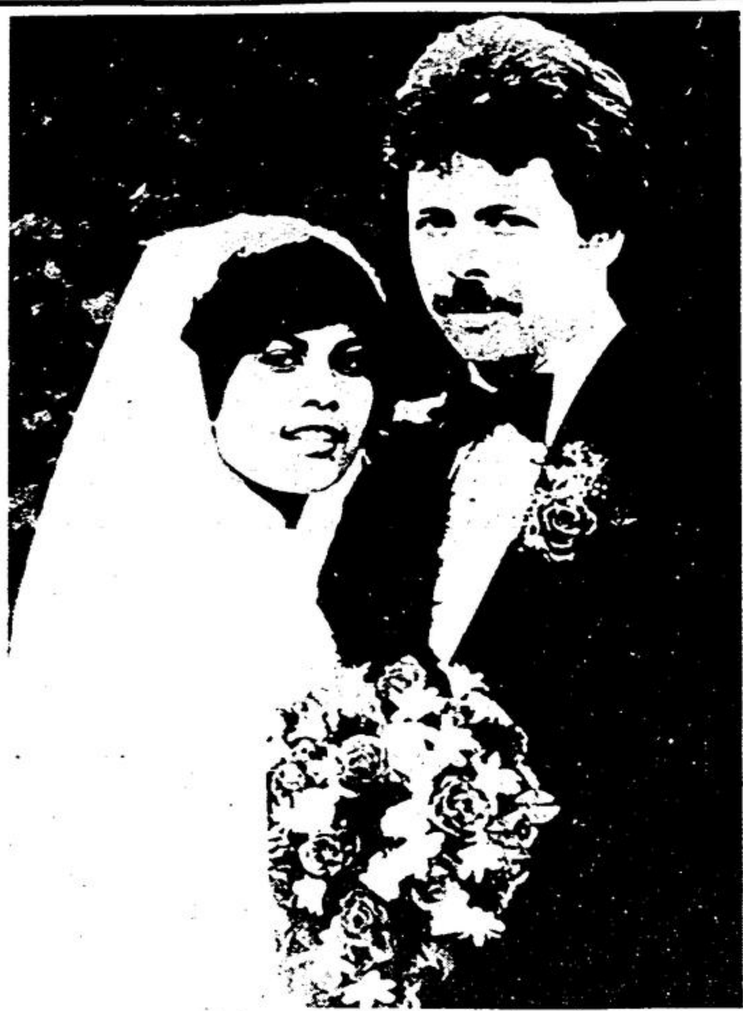
Town girl-lovely bride