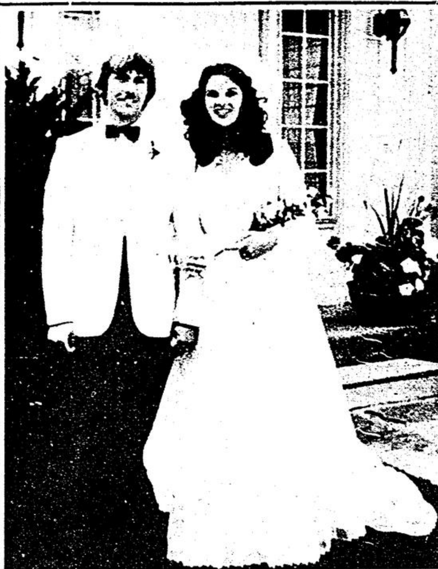
Town couple married in United Church