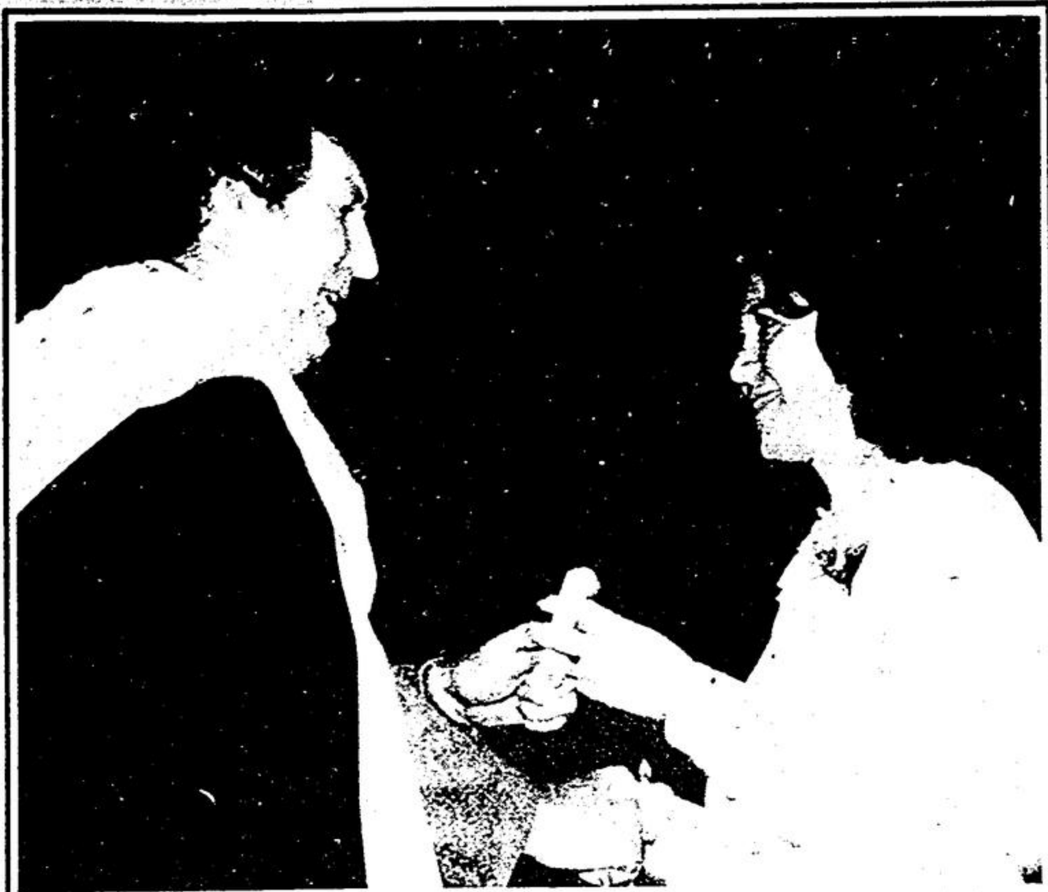
Grade 13 graduate receives diploma at Commencement