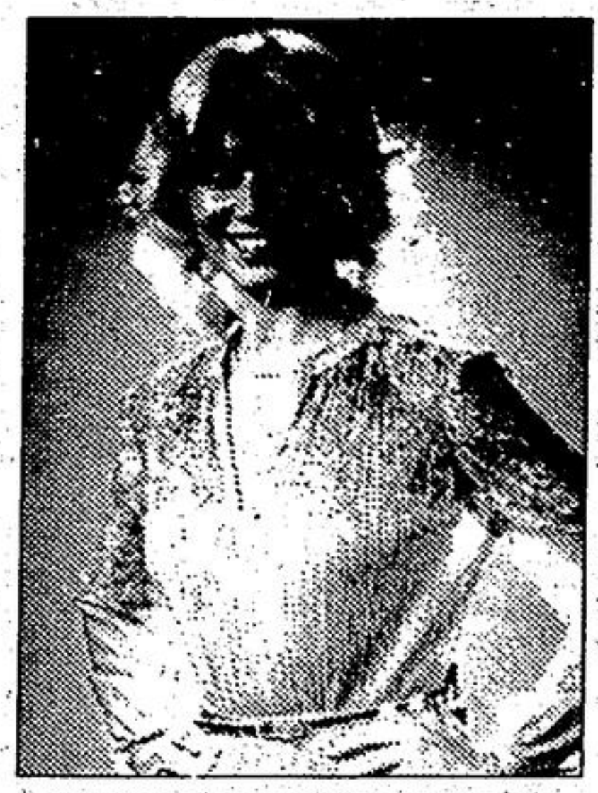
What Professional Weight Control Clinic did to me... they can do it all for you. I lost 20 pounds in 5 weeks and have successfully altered my eating habits and feel fantastic.

in just a matter of weeks the healthy way. FREE CONSULTATION.