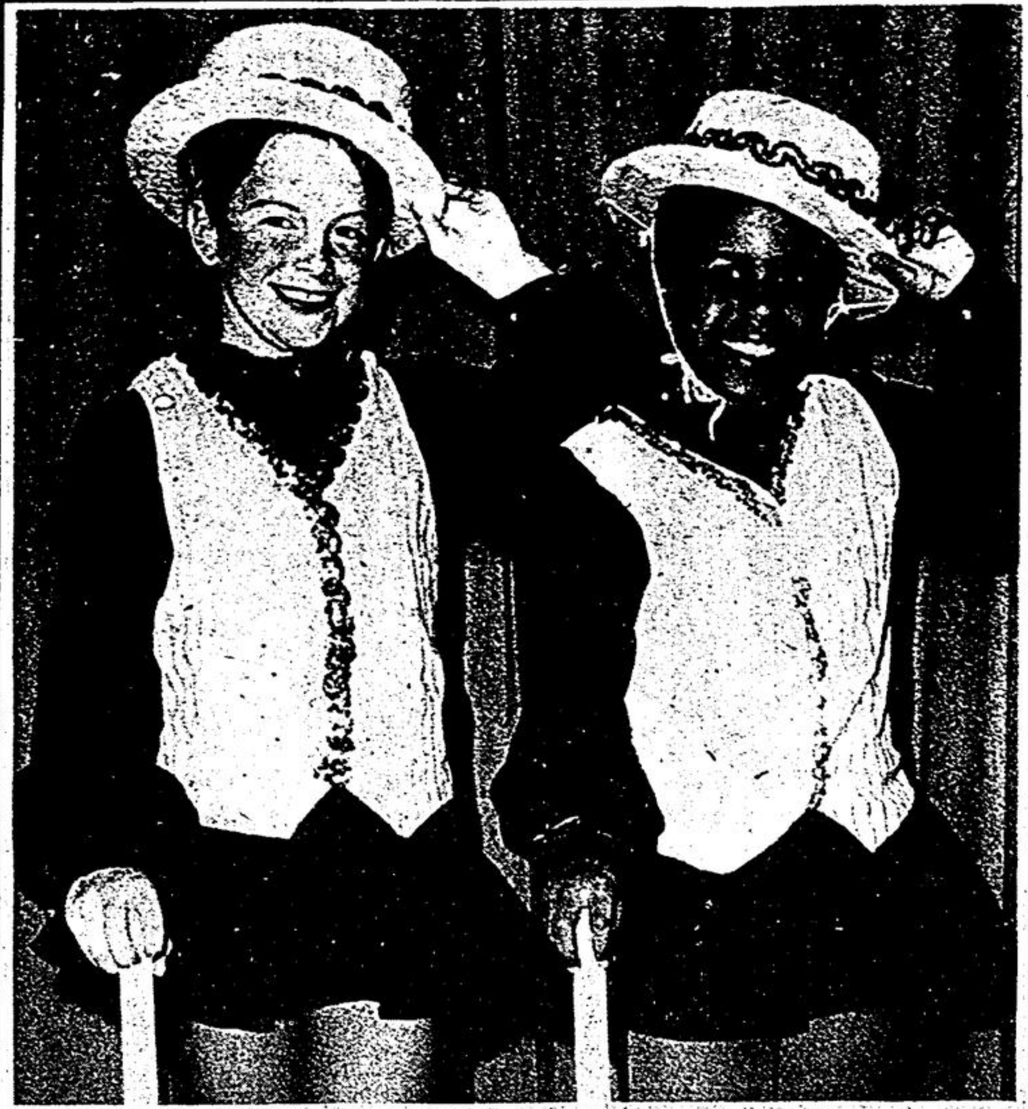
Jazzy pair strut their stuff at dance recital