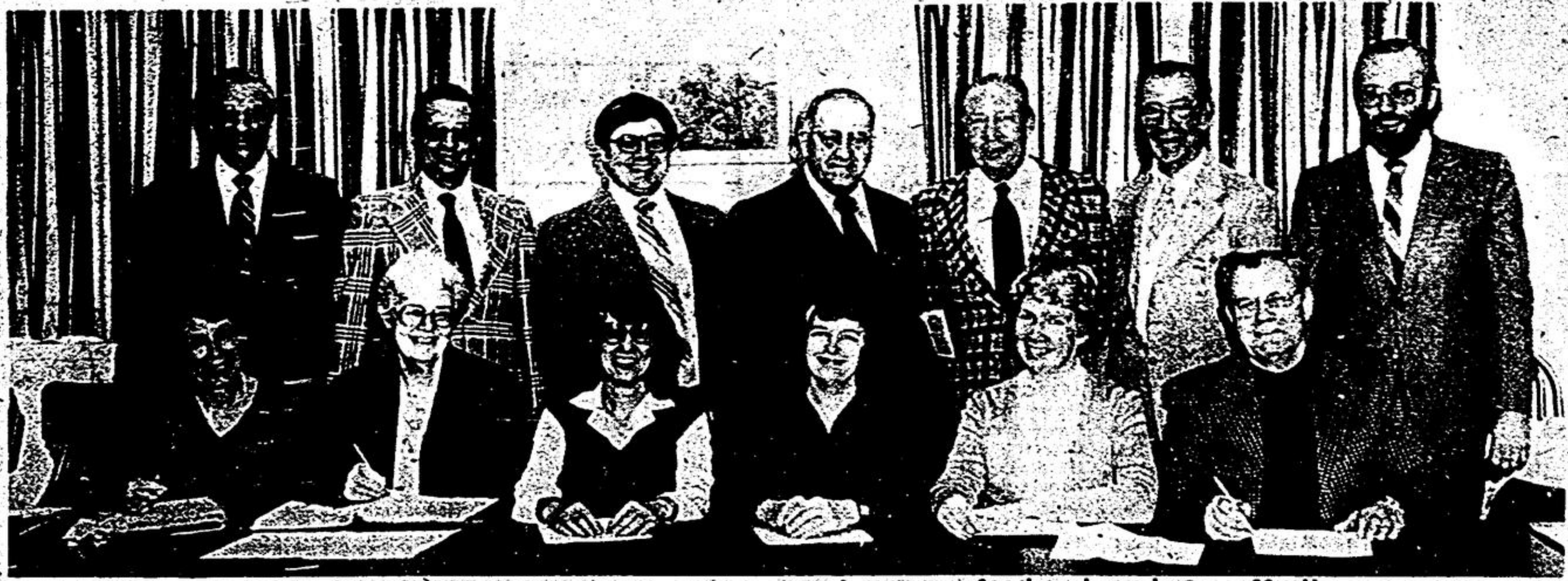
The 1981 Home Support Services' Board, Town of Whitchurch-Stouffville